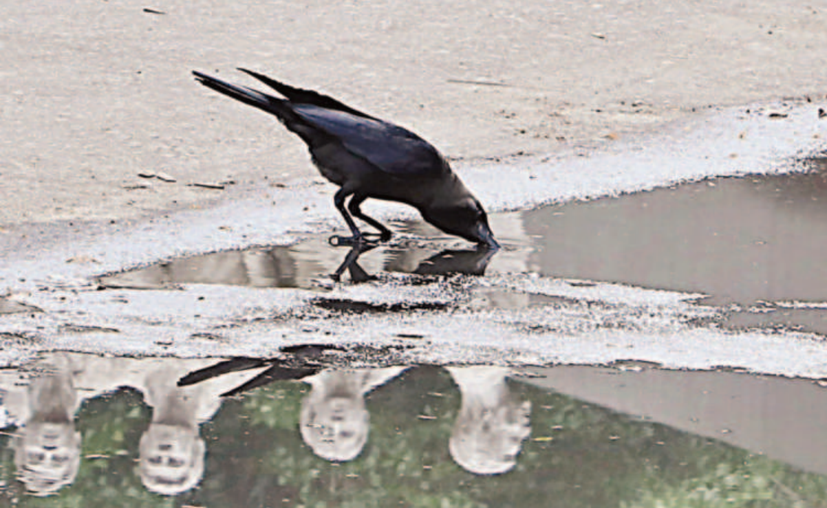
Amid the scorching heat, a crow quenches its thirst by drinking from the water accumulated on the road. During such extreme weather, it is important for humans to be mindful of the animals. Providing water and food, as well as creating shaded areas for them to rest, can help ensure their survival. This photo was taken from Dhaka University yesterday.

The alliance also set specific reform proposals on state, constitution, constitutional bodies and form of government. Gono Odhikar Parishad on May 6 left the platform amid internal conflicts and mutual doubts within the alliance. The party, however, decided to continue its simultaneous movement separately from now on. It also decided to separately participate in the movements in coordination with other like-minded parties. Of the seven parties, only Jatiya Samajtantrik SEE PAGE 4 COL 3