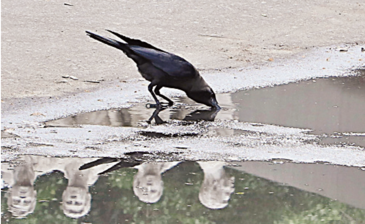
Amid the scorching heat, a crow quenches its thirst by drinking from the water accumulated on the road. During such extreme weather, it is important for humans to be mindful of the animals. Providing water and food, as well as creating shaded areas for them to rest, can help ensure their survival. This photo was taken from Dhaka University yesterday.

The alliance also set specific reform proposals on state, constitution, constitutional bodies and form of government. Gono Odhikar Parishad on May 6 left the platform amid internal conflicts and mutual doubts within the alliance. The party, however, decided to continue its simultaneous movement separately from now on. It also decided to separately participate in the movements in coordination with other like-minded parties. Of the seven parties, only Jatiya Samajtantrik SEE PAGE 4 COL 3