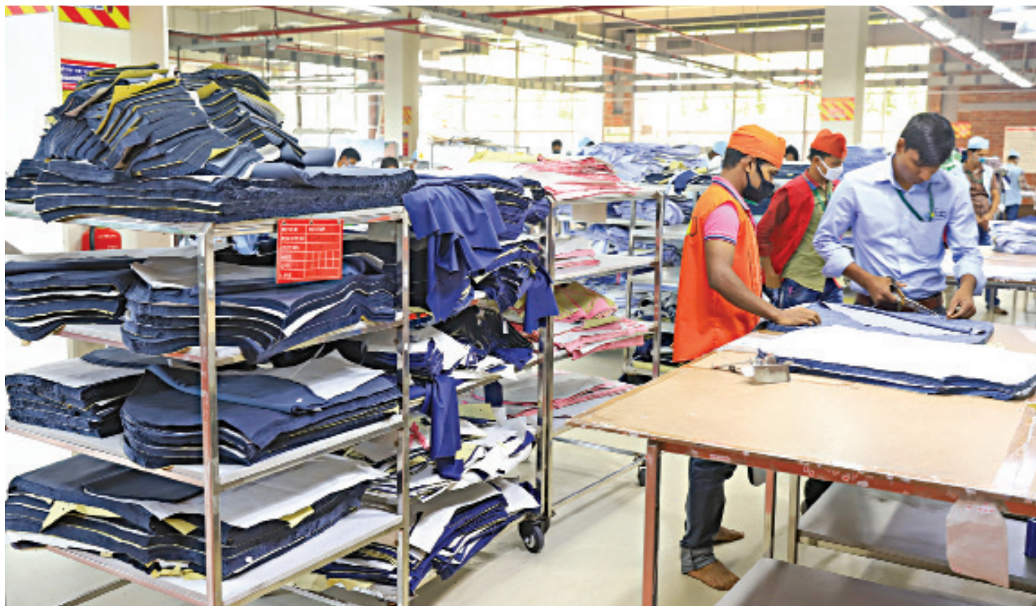
Bangladesh exported apparel items worth $9.01 billion to the US in the fiscal year of 2021-22, registering 51.57 per cent year-on-year growth.

The barometer plunged into negative territory in the wake of Russia's invasion last February.