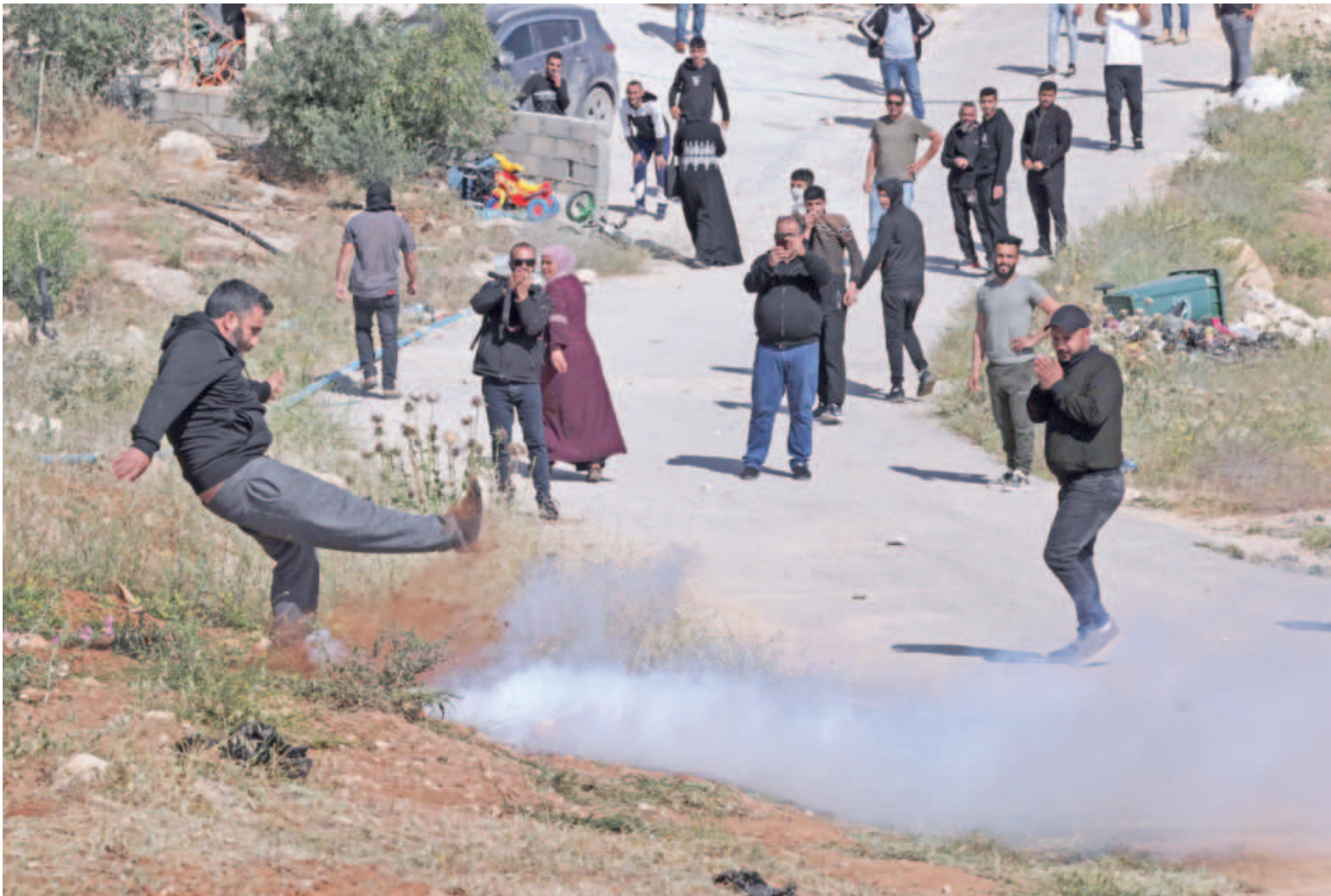
A Palestinian protester kicks a tear gas canister during confrontations with Israeli troops as army bulldozers demolished a school that the Israeli authorities said was built without permission in the village of Jabbet al-Dhib, east of Bethlehem in the occupied West Bank yesterday.