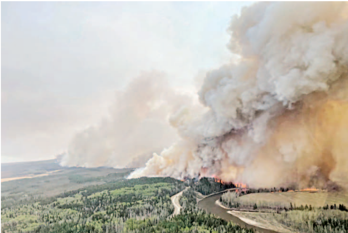
A smoke column rises from wildfire EWF-035 near Shining Bank, Alberta, Canada on Saturday. Alberta announced a state of emergency as wildfires flared across the Canadian province, forcing 25,000 people to flee their homes in what a top official said was an "unprecedented" crisis.