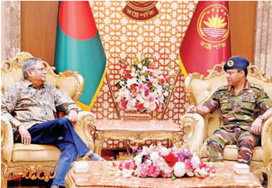
Chief of Army Staff General SM Shafiuddin Ahmed pays a courtesy call on President Mohammed Shahabuddin at Bangabhaban yesterday afternoon.