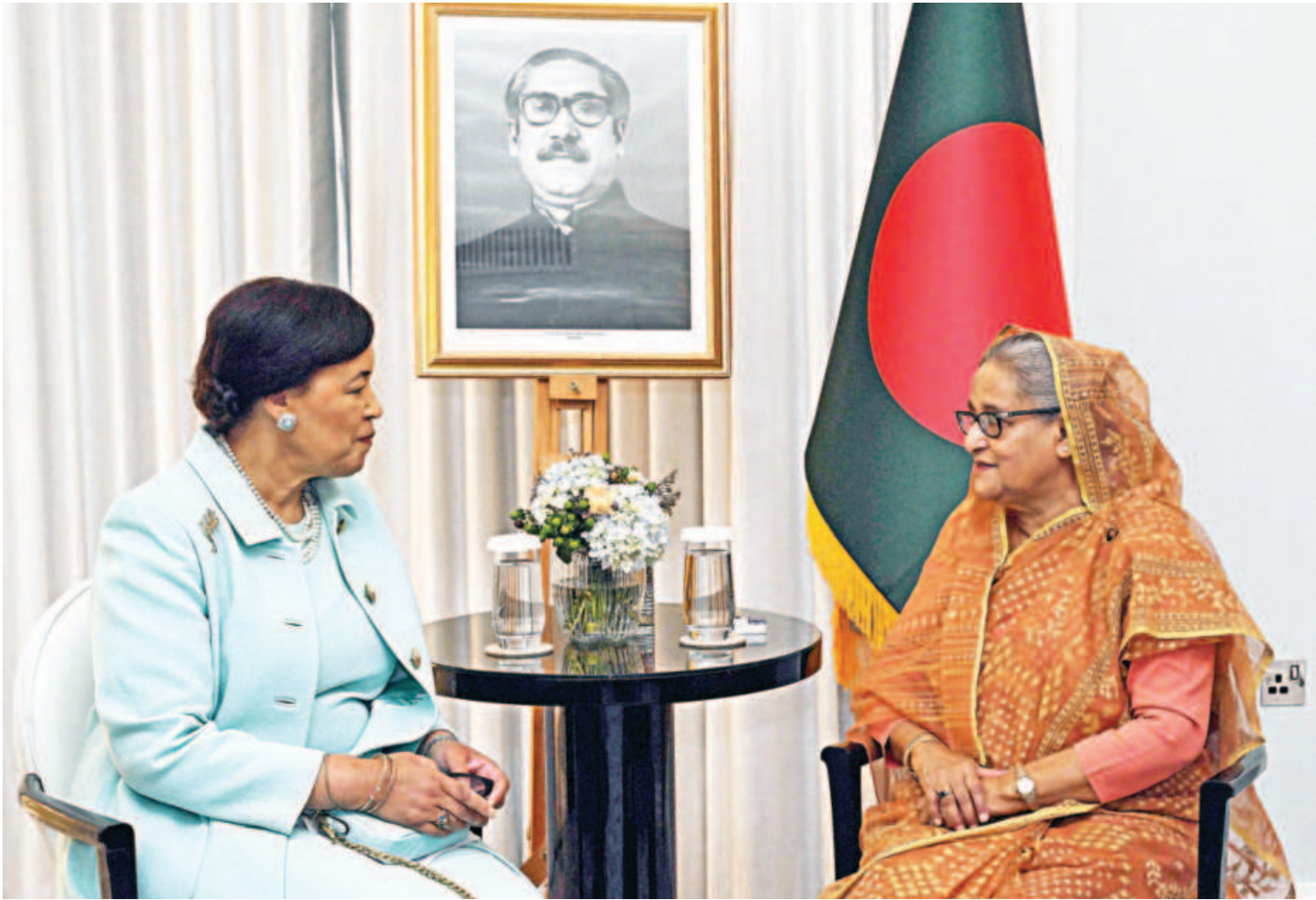
Prime Minister Sheikh Hasina at a meeting with Commonwealth Secretary General Baroness Patricia Scotland at the Claridge Hotel in London yesterday.