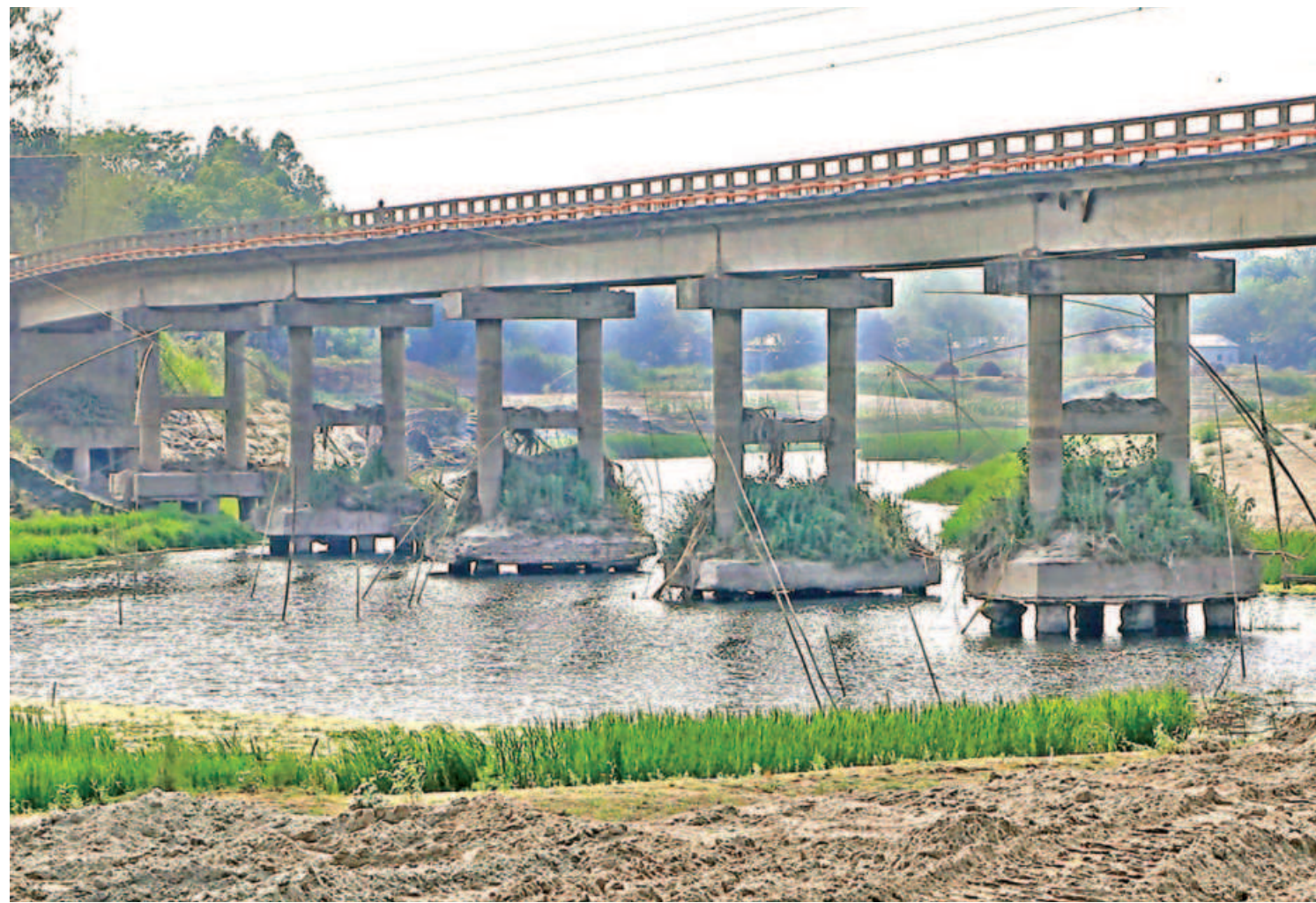
Illegal sand lifting from the Dhaleswari river at Charabari in Tangail Sadar upazila threatens a nearby bridge. People of five unions use this bridge to get to the district town. The photo was taken recently.