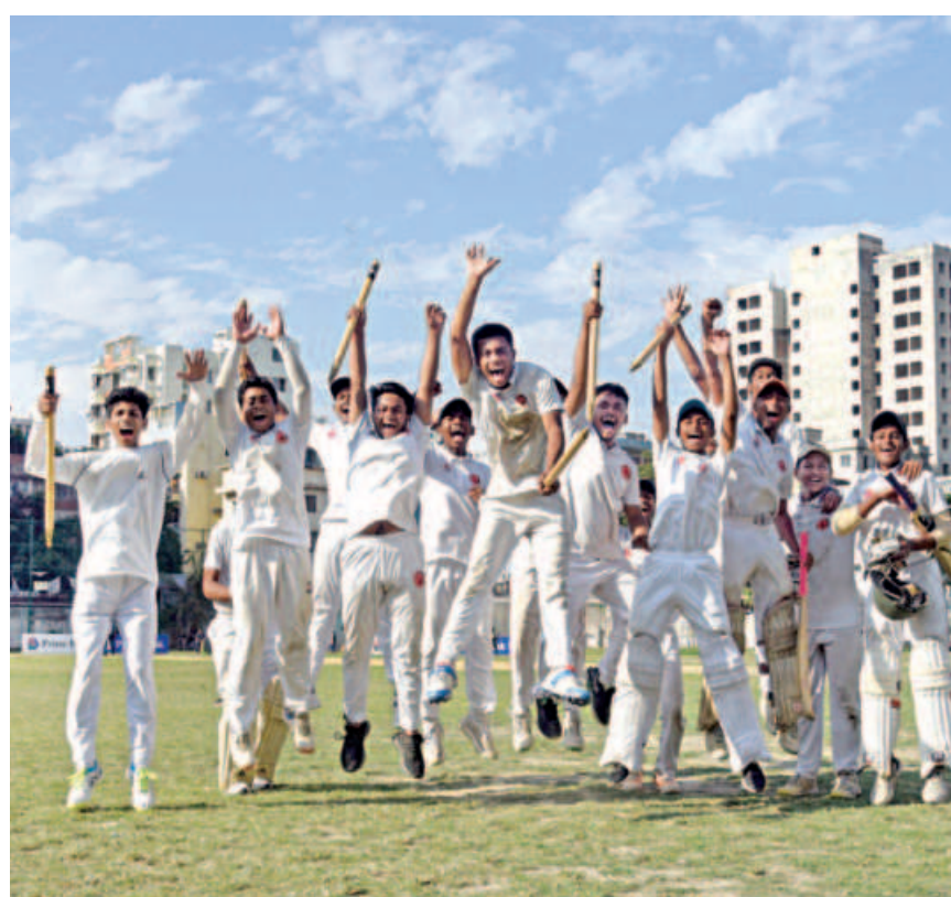
The victorious Cambrian School and College players celebrate after beating Wiles Little Flower School and College by five wickets in the Dhaka Metro final of the Prime Bank National Cricket Tournament at the City Club ground yesterday.