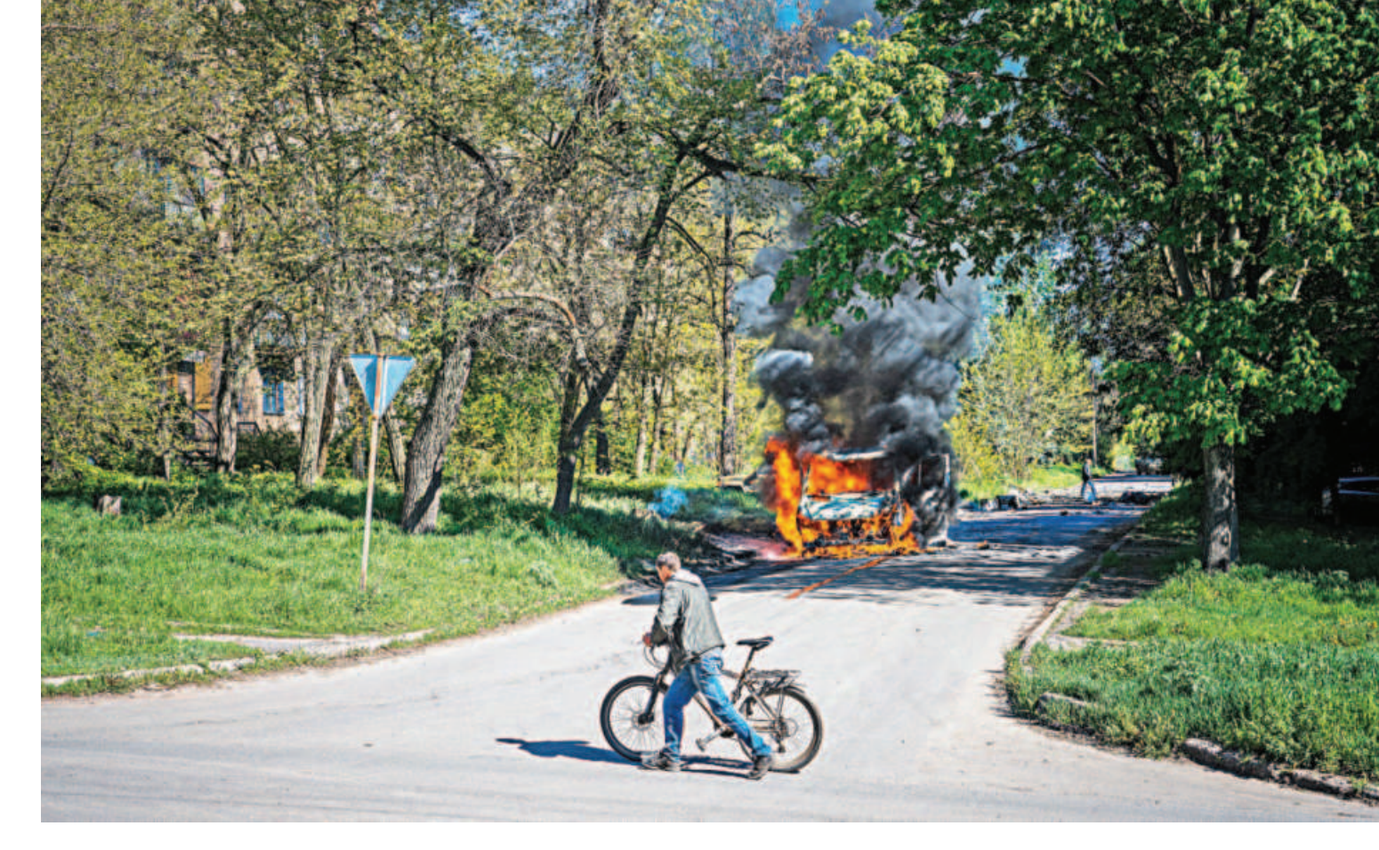
A local resident pushes his bicycle next to a car burning after a shelling in a street of Kostyantynivka, Donetsk region yesterday, amid the Russian invasion of Ukraine.

Since the El Nino effect on global temperatures usually plays out the year after it emerges, the impact will likely be most apparent in 2024, it said.