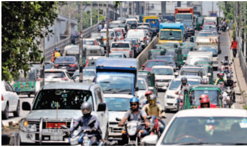
The capital was back to its usual form yesterday, with traffic congestions a common feature across the city. This photo was taken in Bijoy Sarani area yesterday morning.