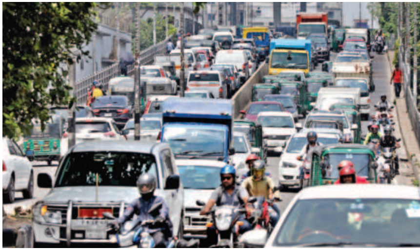
The capital was back to its usual form yesterday, with traffic congestions a common feature across the city. This photo was taken in Bijoy Sarani area yesterday morning.