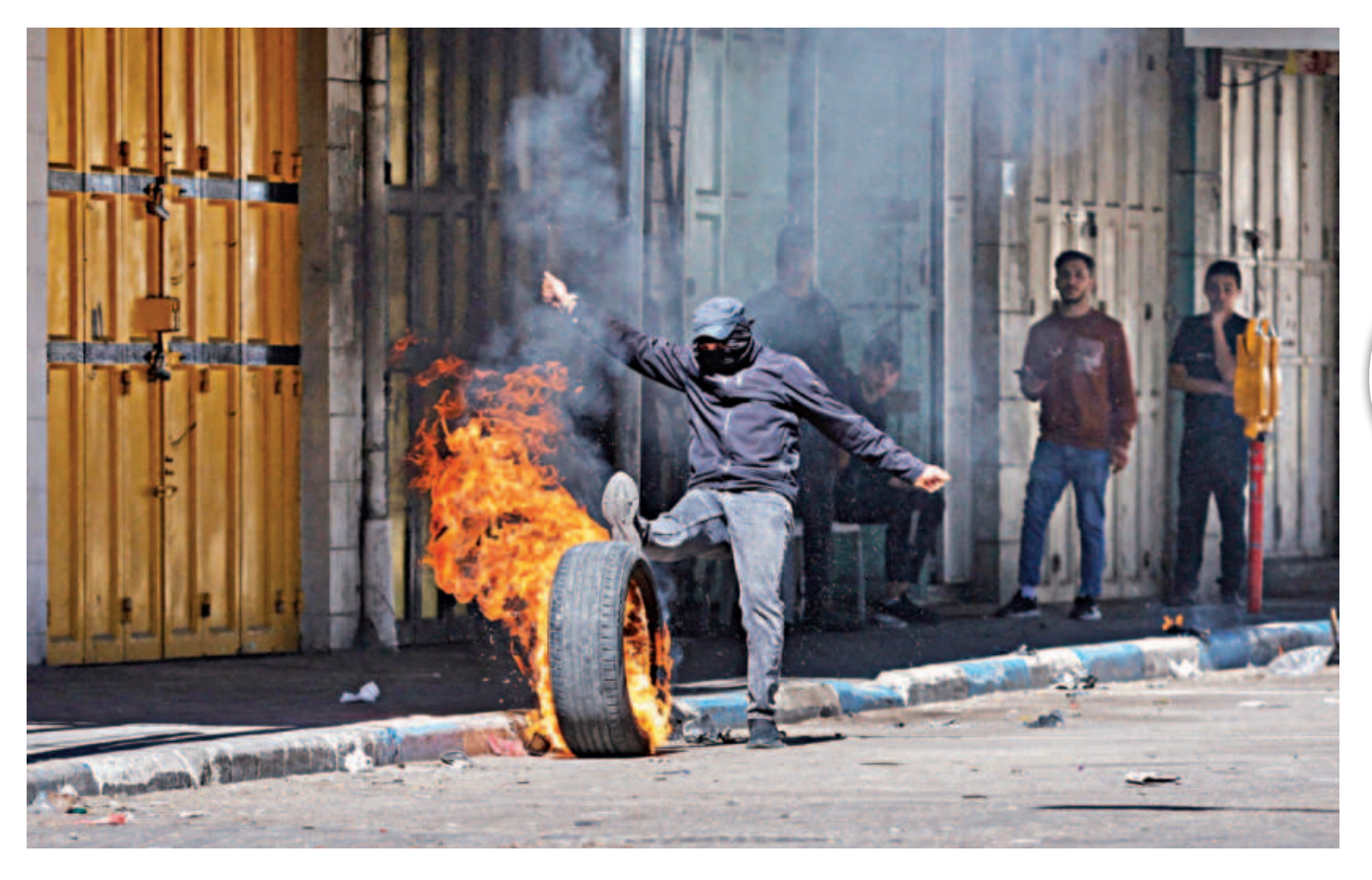
A Palestinian kicks a burning tire during clashes between Palestinians and Israeli soldiers following the death of Palestinian prisoner Khader Adnan during a hunger strike in an Israeli jail, in Hebron in the Israeli-occupied West Bank yesterday. The Israeli military also traded fire with Gaza militants in a flare-up of violence following the death of Adnan.

A joint statement said this meant that any armed attack on Philippine armed forces, public vessels or aircraft in Pacific,