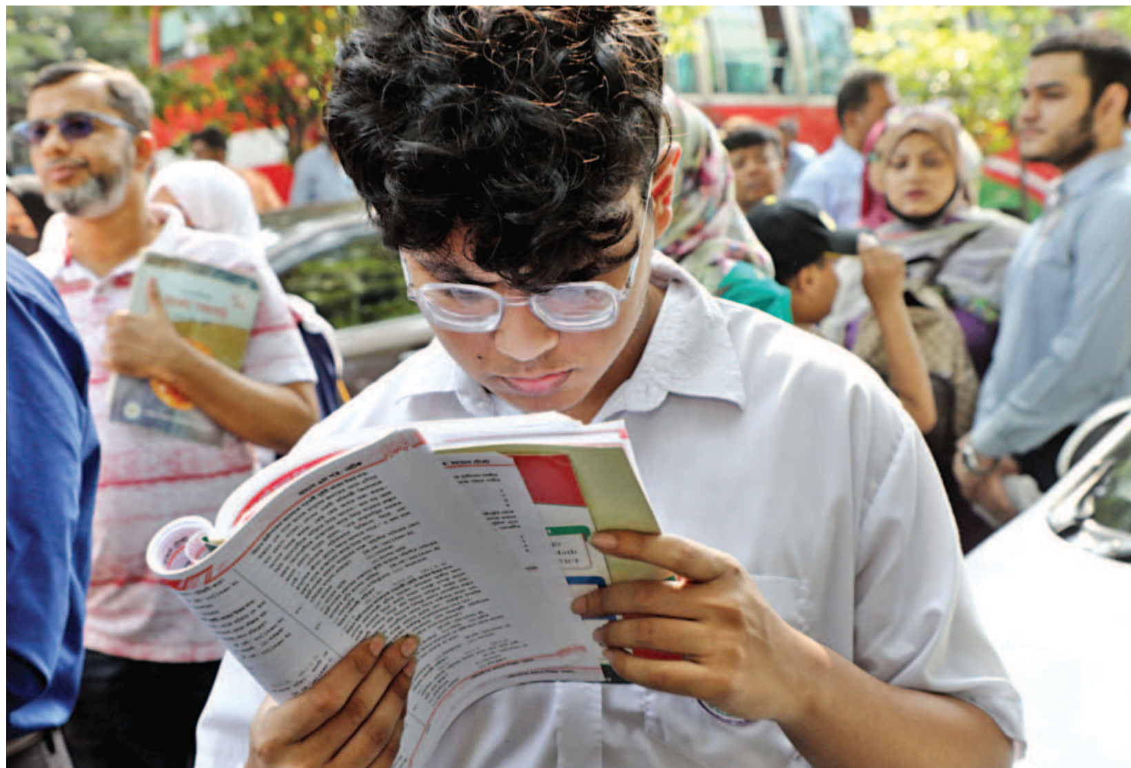
A candidate goes over his textbook for a last-minute revision, right before sitting for the Bangla (first paper) test as SSC exams began across the country yesterday. The photo was taken in front of the exam centre in Motijheel Government Boys High School.