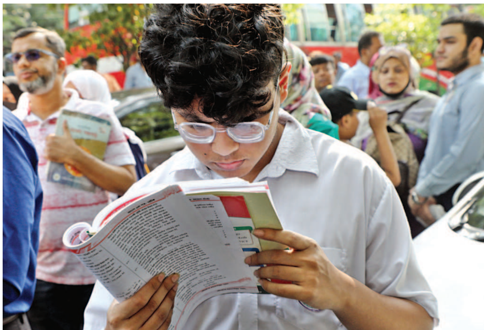
A candidate goes over his textbook for a last-minute revision, right before sitting for the Bangla (first paper) test as SSC exams began across the country yesterday. The photo was taken in front of the exam centre in Motijheel Government Boys High School.