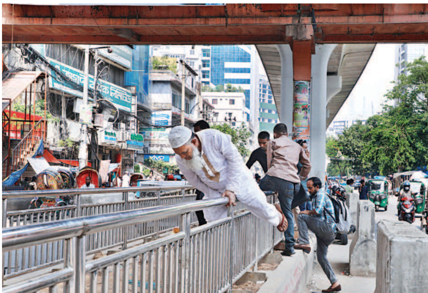
Steel railing installed along the central reservation of the road in the capital's Baitul Mukarram area cannot stop people from jaywalking. A footbridge is right there but they would not use it. The photo was taken yesterday.

Students are directed to arrive at the centres 30 minutes before the exams, while set codes for questions papers will be sent to them via SMS 25 minutes before exams begin.