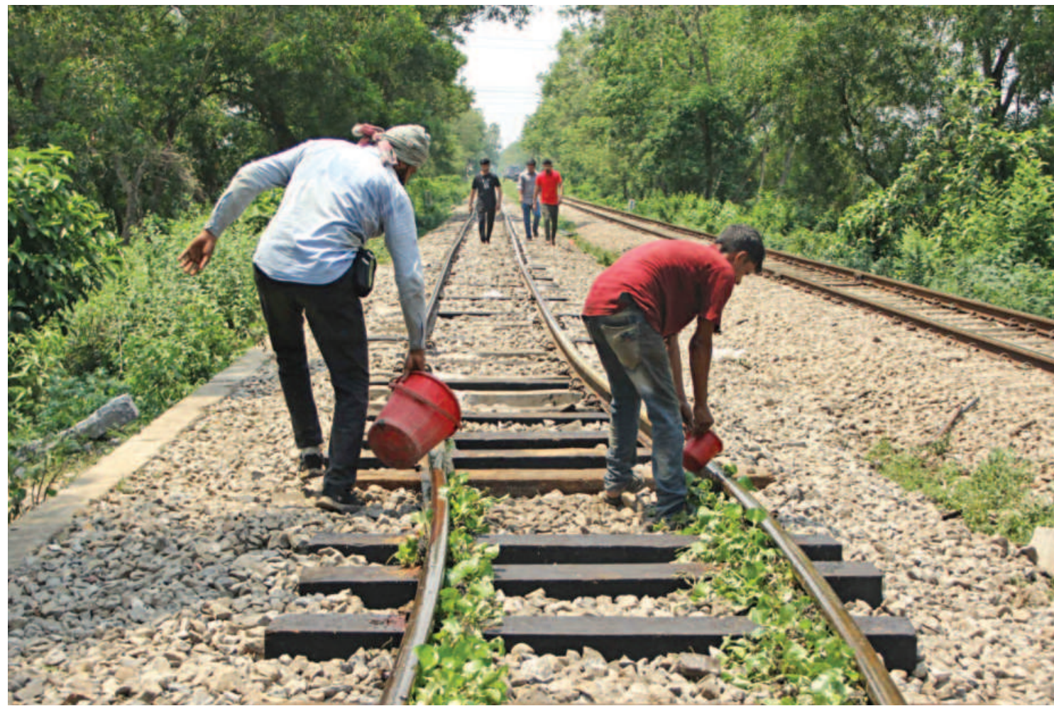
Railway staffers use water and hyacinths to cool down a section of rail tracks which bent due to "excessive heat" in Brahmanbaria's Dariapur area yesterday. Train service between Dhaka and Sylhet and Chattogram was disrupted as only one of the two lines were serviceable.

"A worker needs a wage that not only meets their basic needs but also that of their family, taking into account that one family could have a single earning member."