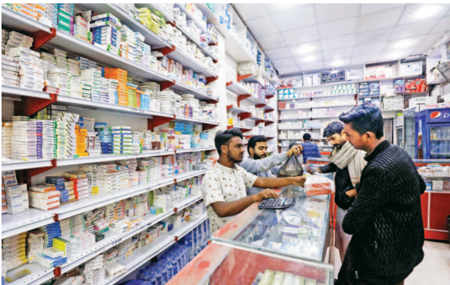
Customers buy medicine from a medical supply store in Karachi. Pakistan's annual inflation rate hit 35 per cent in March, fuelled by a depreciating currency, a rollback in subsidies and the imposition of higher tariffs to secure a bailout package of $1.1 billion from the International Monetary Fund.