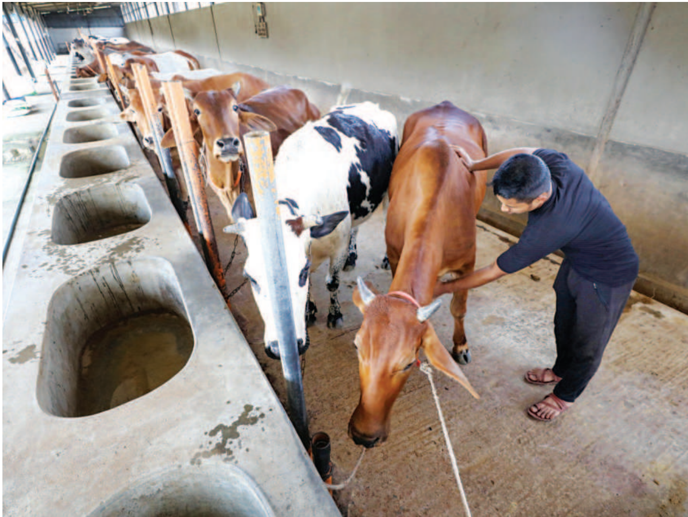
The five-year project styled "Expansion of Artificial Reproductive Technology and Implementation of Embryo Transfer Technology" was taken to expand artificial insemination programmes at the union level, implement cattle embryo transfer technology and increase cattle semen production to ensure increased availability of meat and milk in the country.