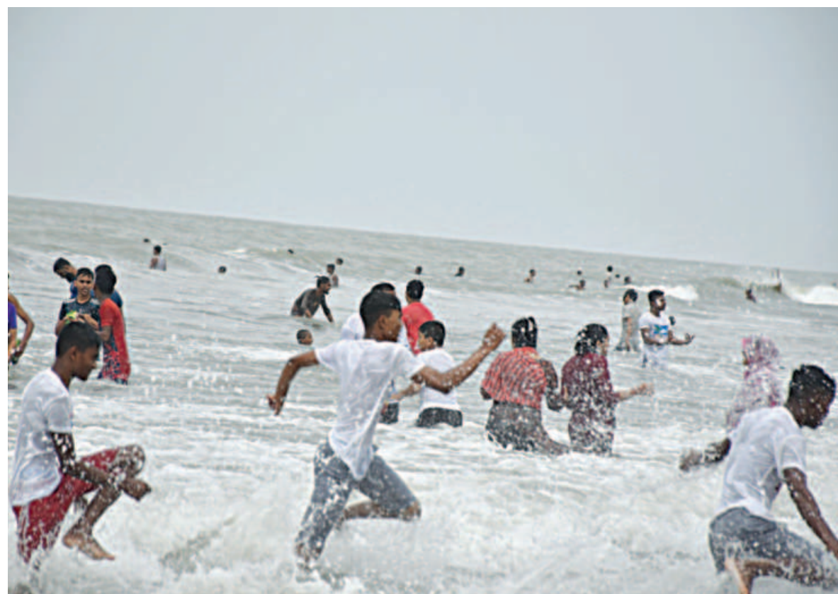
Although travel costs have risen amid the ongoing inflationary pressure, tourism in Bangladesh reached the expected level during this year's Eid-ul-Fitr. Here, tourists are seen frolicking on the Kuakata beach in Patuakhali during the holiday.