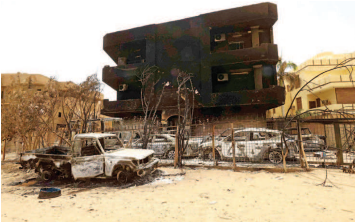
Damaged cars and buildings are seen at the central market during clashes between the paramilitary Rapid Support Forces and the army in Khartoum North, Sudan yesterday.

“What the US is doing ... provokes confrontation between camps, undermines the nuclear non-proliferation regime and the strategic interests of other countries,” Mao said.