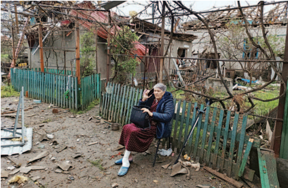
A local woman speaks on her phone as she sits on a bench next to a residential house damaged by a Russian missile strike, amid Russia’s attack on Ukraine, in Mykolaiv, Ukraine yesterday.

Biden tried joking, saying “I can’t even say I guess how old I am. I can’t even say the number – it doesn’t register.”