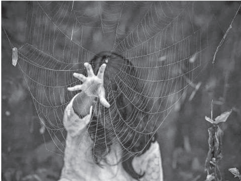
It is up to the adults to stand up for the children and ensure safe space for them.

And it is up to us as a nation to ensure that our children grow up empowered, healthy – physically, emotionally and mentally – and confident to realise their full potential.