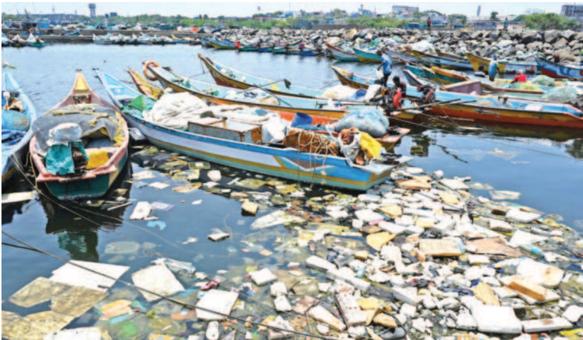
Fishermen work on their boats amid floating waste at Kasimedu fishing harbour during a 61-day trawling ban in Chennai yesterday.