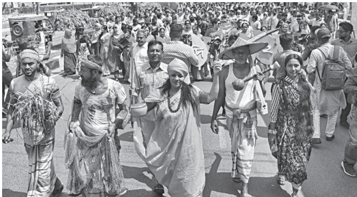
Adorned in colourful attires, residents of Khulna walk in a rally, celebrating Khulna’s 142nd anniversary yesterday. The rally was organised by Greater Khulna Development Struggle Coordination Committee. This photo was taken in the city’s Shibbari Mor area.

Necessary steps will be taken for constructing the approach roads, he added.