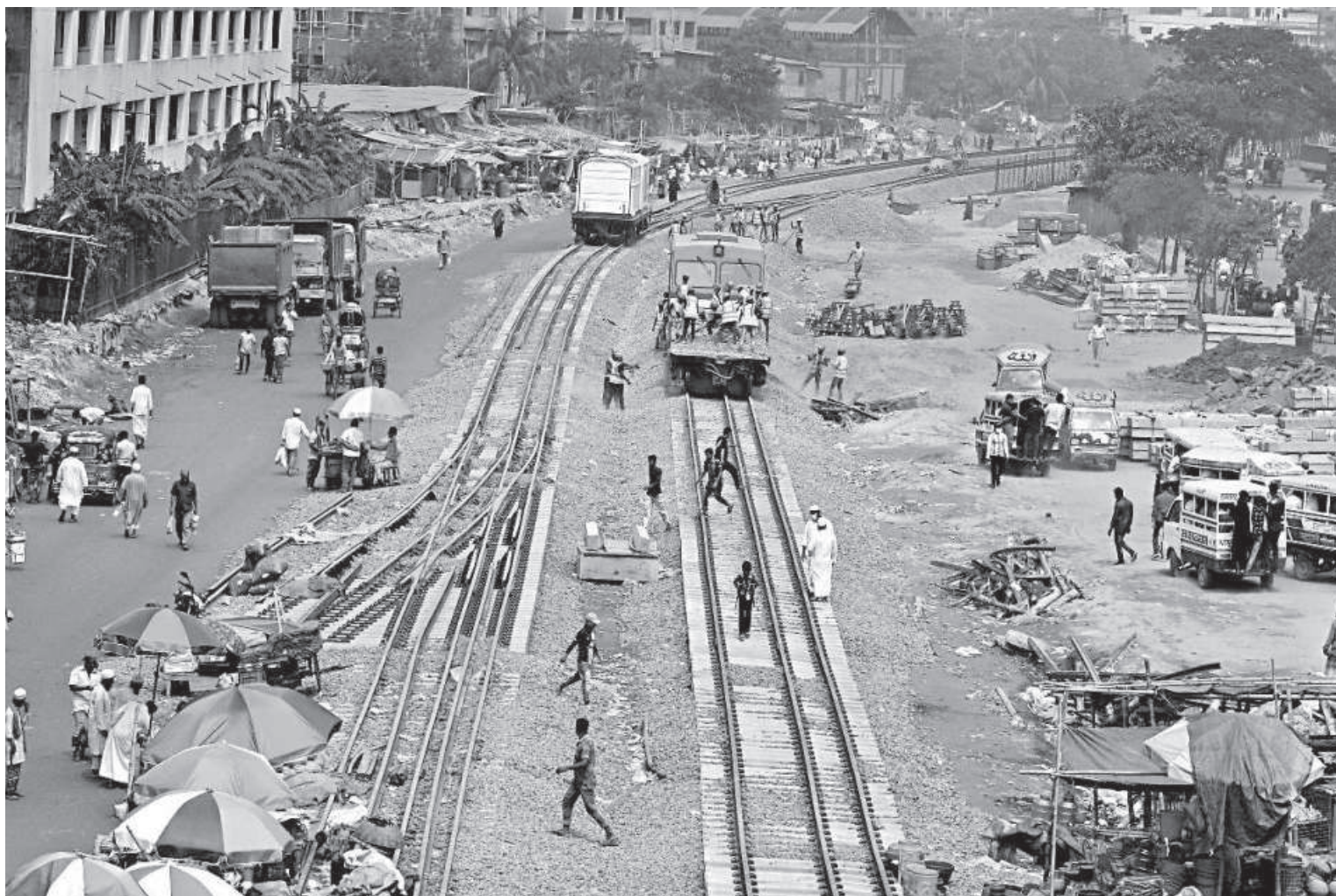
Passengers can finally breathe a sigh of relief as rail operation between Dhaka and Narayanganj is likely to resume early next month, with the new rail line between Kamalapur and Gendaria steadily inching towards completion.