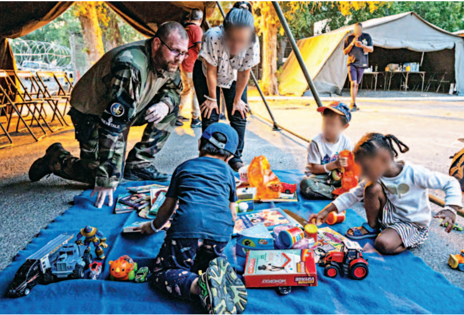
French citizens at the air base of the French Army forces stationed in Djibouti after French soldiers evacuate French nationals from Sudan to Djibouti, in Djibouti, on Sunday.

to go next. But first of all, we have to give a message that we are united. I have said earlier too that I have no objections. I want BJP to become zero. They have become a big hero with media’s support and lies”, Mamata said. “We will go ahead together. We have no personal ego, we want to work together collectively”, she added. Nitish Kumar and Tejashwi Yadav were also expected to meet Samajwadi Party president Akhilesh Yadav in Lucknow yesterday as part of efforts to forge a united opposition for 2024 general elections. The meeting comes days after Nitish Kumar had met Rahul Gandhi and Congress president Mallikarjun Kharge in the capital. At the press conference held after the meet, Nitish had said, “We will try to unite as many political parties as we can and move forward together”. Rahul’s disqualification as a Lok Sabha MP recently precipitated a rare show of unity across opposition parties. Nitish has also met with Delhi Chief Minister and Aam Aadmi Party boss Arvind Kejriwal.