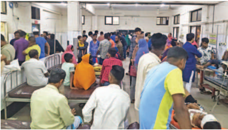
NITOR's emergency ward saw a rush of patients during the Eid holidays.

While visiting some government hospitals, this