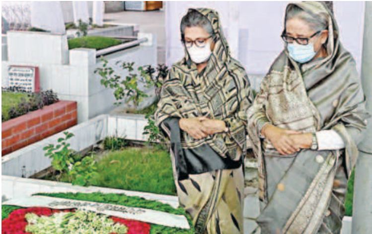
Sheikh Hasina along with her younger sister Sheikh Rehana paid tribute to August 15 martyrs at the Banani graveyard on Sunday.