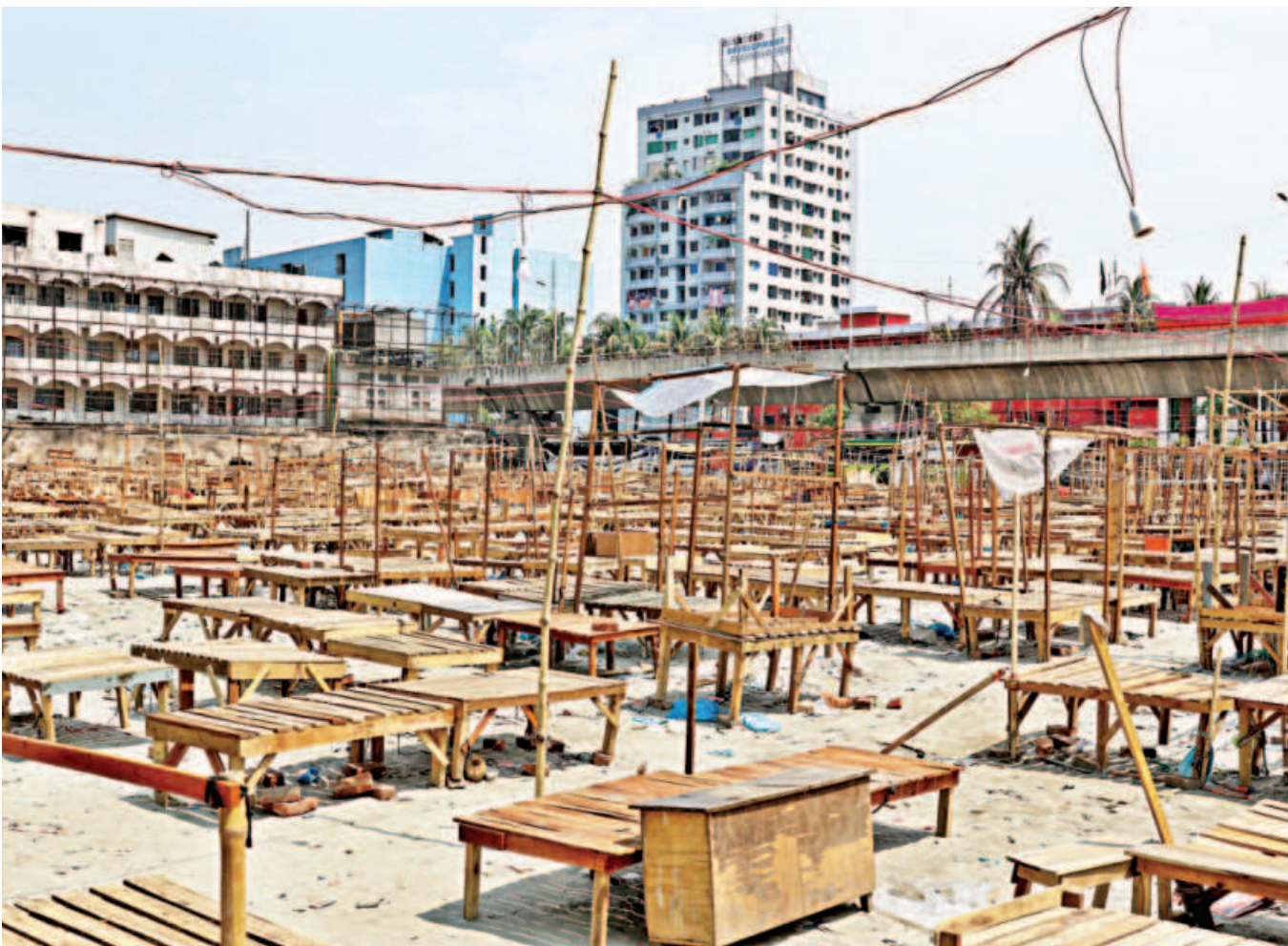
Scene from Bangabazar Market after Eid. After the massive fire that ravaged the market on April 4, traders set up their shops with these makeshift arrangements under the open sky. During a visit to the spot yesterday, the area was found deserted for the ongoing Eid holiday.