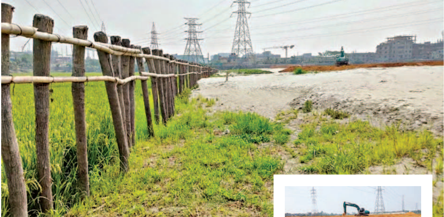
Bangladesh Agricultural Development Corporation (BADC) has filled 11 acres of 53-acre water retention area in Gabtoli's Goidartek. Environmentalists and locals fear that the filling of the land will adversely affect the drainage in and around the adjacent areas and adversely affect the biodiversity.