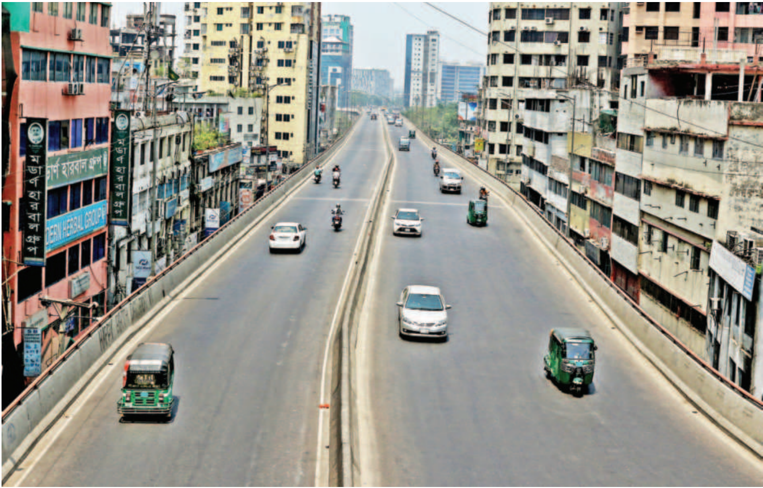
The roads in the capital are devoid of the rush of vehicles as many city-dwellers have already left the capital to celebrate Eid outside Dhaka. The photo of the nearly empty Moghbazar-Mouchak flyover was taken yesterday.