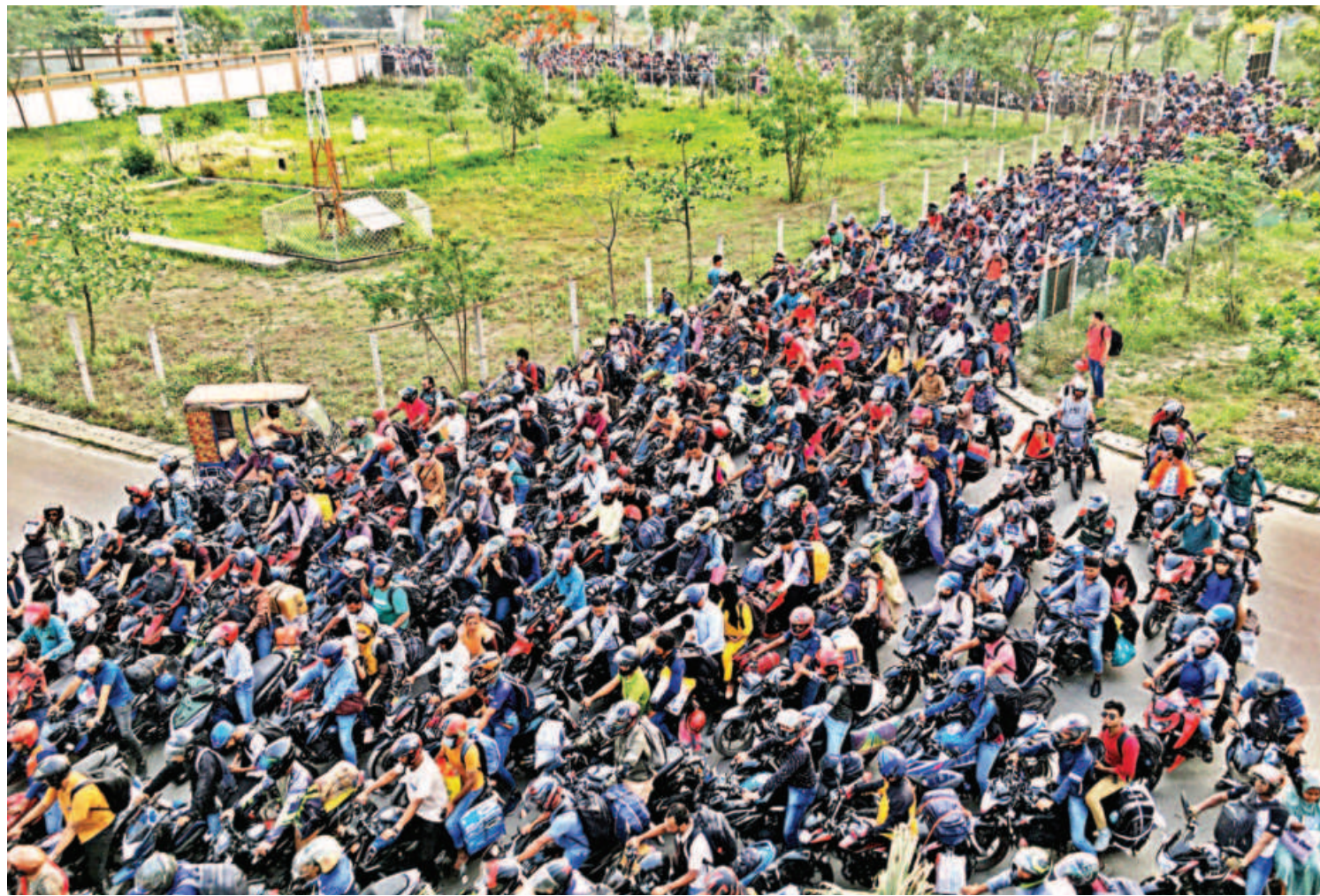
Hours after the government lifted a ban on bikes on the Padma Bridge, motorcycles form long queues on the Mawa end yesterday. With Eid round the corner, holidaymakers continued to head out of Dhaka for their homes in villages and towns.