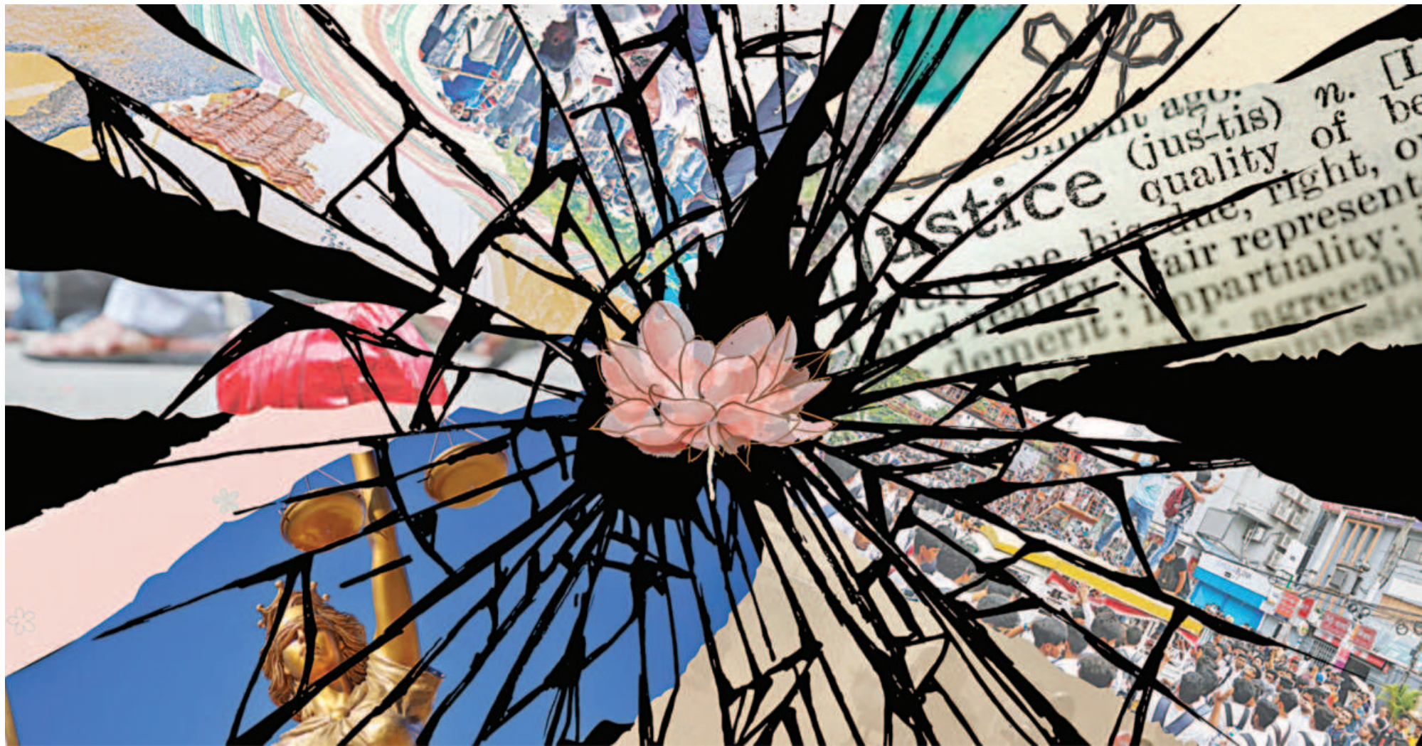
ILLUSTRATION: SYEDA AFRIN TARANNUM