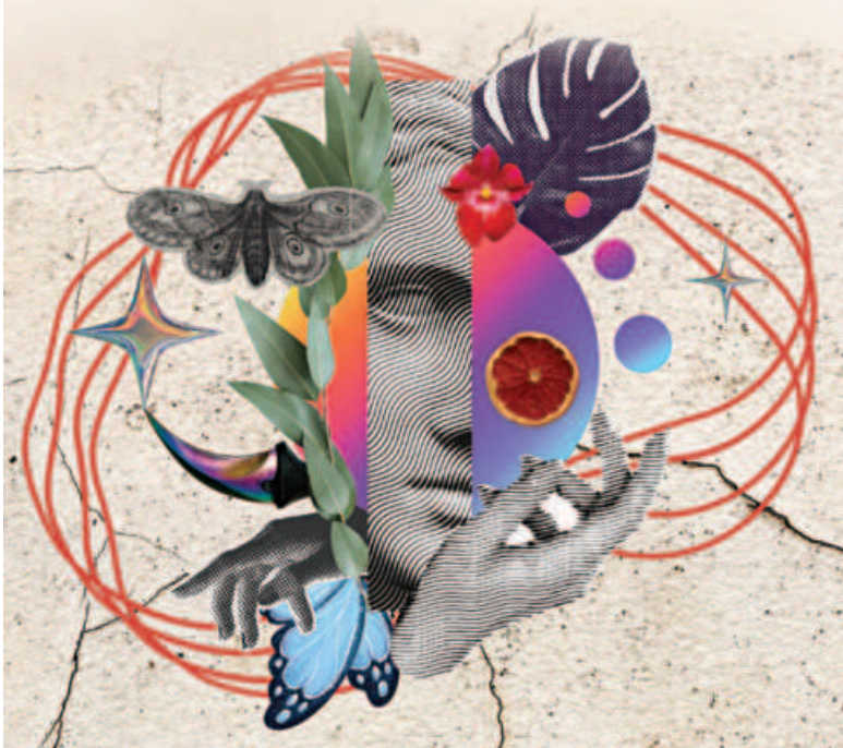
ILLUSTRATION: FATIMA JAHAN ENA

The writer is a student of Class 7 at Southbreeze School.