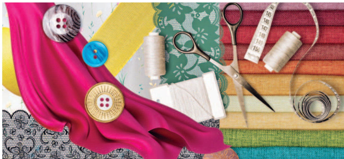
ILLUSTRATION: FATIMA JAHAN ENA

While I'm running errands to collect materials, it's not only the feminine floral prints that allure. One of my favourite places to shop is the men's fabric store. I