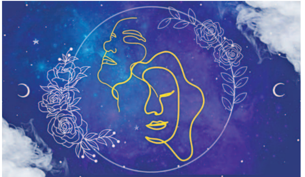
ILLUSTRATION: FAISAL BIN IQBAL