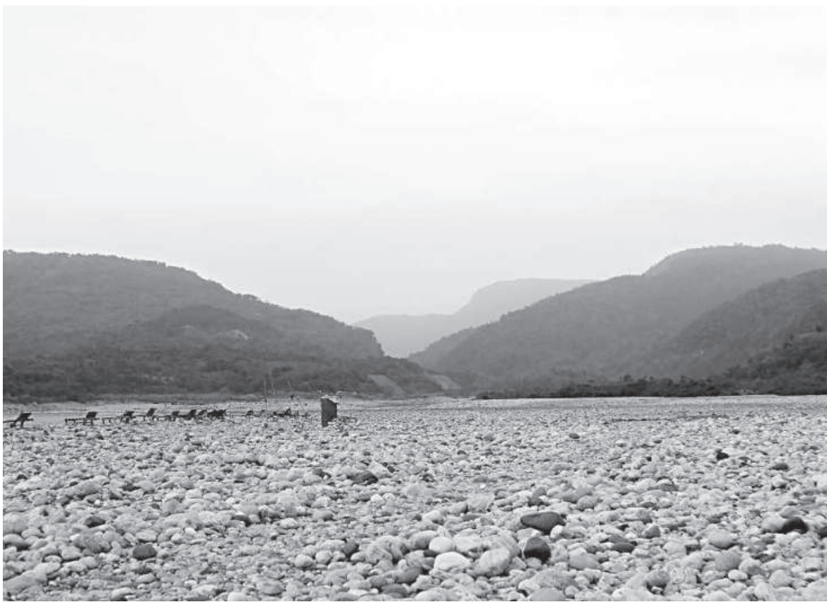
Sada Pathor, a heaven made of white stones in Sylhet, is an ideal place to get away from the hustle and bustle of daily life and be captured by nature's breathtaking beauty. With nearby views of Meghalaya's mountains, it's no surprise that hundreds of travellers visit this peaceful destination every day, especially around Eid holidays. This photo was taken recently.