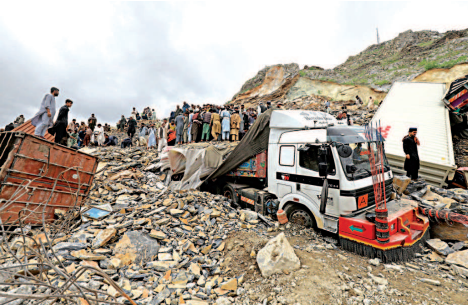
People search for survivors next to damaged supply vehicles after a landslide close to the Torkham border in Pakistan yesterday. A landslide during a thunder and lightning storm on the main road through northwest Pakistan's Khyber Pass buried more than 20 trucks yesterday, killing at least two people, with dozens more feared trapped, officials said.

This month, curfews were extended to UN's Afghan female employees and the organisation said it faces an "appalling choice" over whether to continue aid schemes. Yesterday, UNDP released data estimating 34 million Afghans were living below the poverty line.