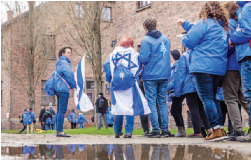
Participants are seen before the annual March of The Living to honour the victims of the Holocaust at the Memorial and Museum Auschwitz-Birkenau on the site of the Auschwitz concentration camp in Oswiecim, Poland yesterday.

Mexico's president said Monday that his country would not tolerate spying by US on its security institutions, as an intelligence leak sparked new diplomatic tensions between the neighbours. "Acts of spying cannot be used to find out what our security institutions are doing and, furthermore, with the arrogance of leaking the information to The Washington Post," Andres Manuel Lopez Obrador said. He was referring to a report citing a leaked US classified document on tensions between branches of Mexico's armed forces.