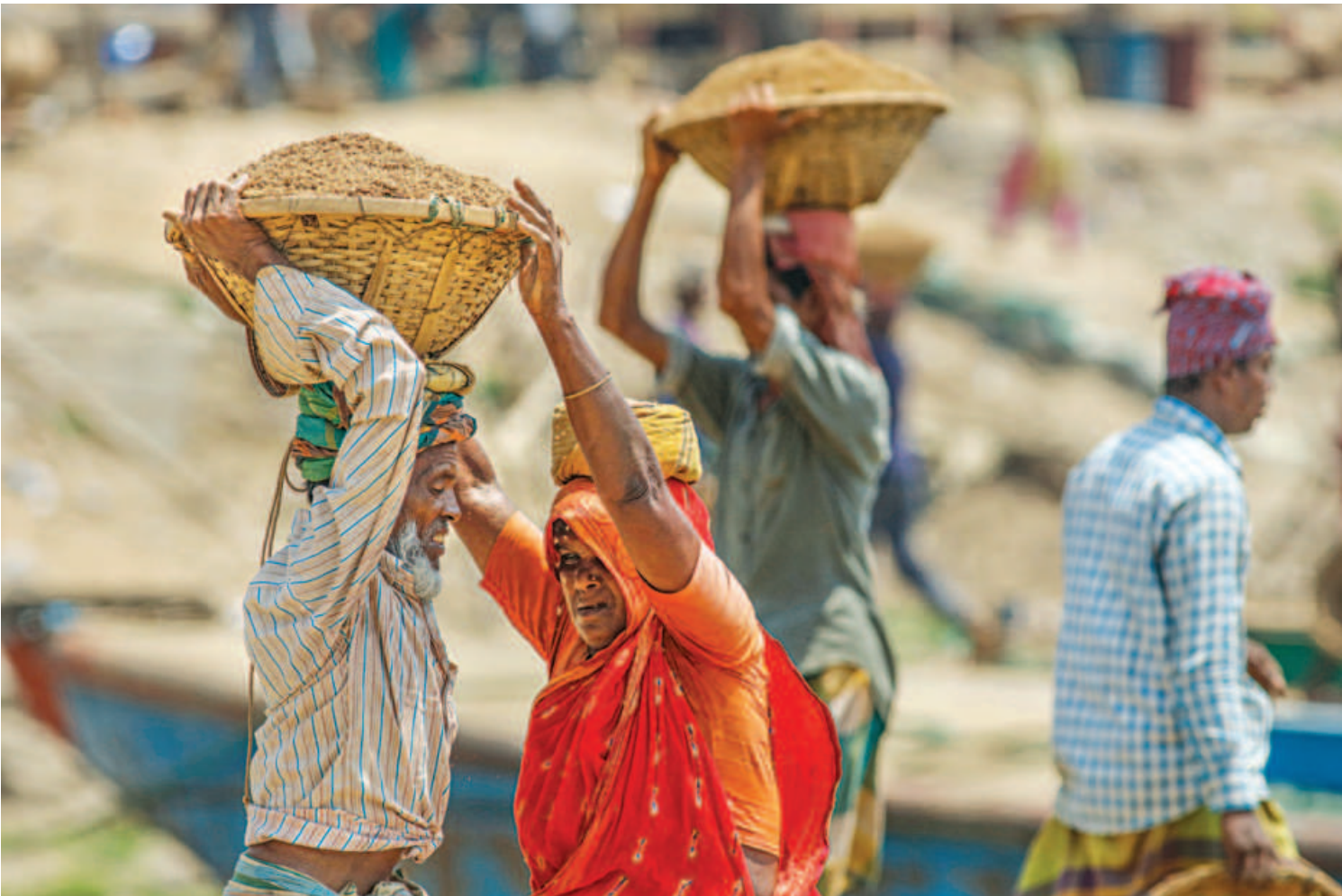
Under the scorching sun, two workers persist in their task of transferring sand. Their sweat-drenched clothes and exhausted expressions is a glimpse into their daily struggle. This photo was taken in Gabtoli Landing Station yesterday.