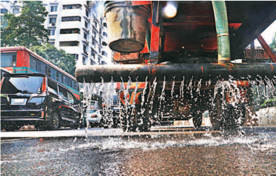
As the weather has been particularly dry throughout last week, the city has become more dust prone than ever. To prevent this menace, city-corporation trucks were seen spraying water on the roads in a drive. This photo was taken in Paribagh area yesterday.