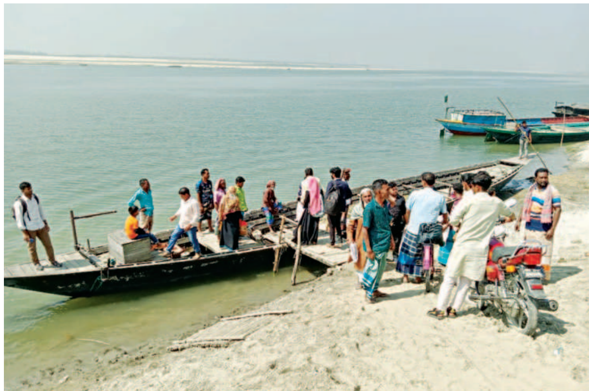
Villagers cross the Vatua river, a branch of the Jamuna, on small boats due to lack of a permanent bridge. The photo was taken from Salal Ghat area in Sirajganj's Kazipur upazila recently.