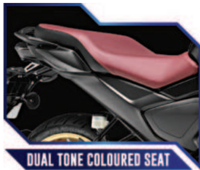
DUAL TONE COLOURED SEAT

The two bikes boast a BS6-compliant 149 cc engine that makes them more