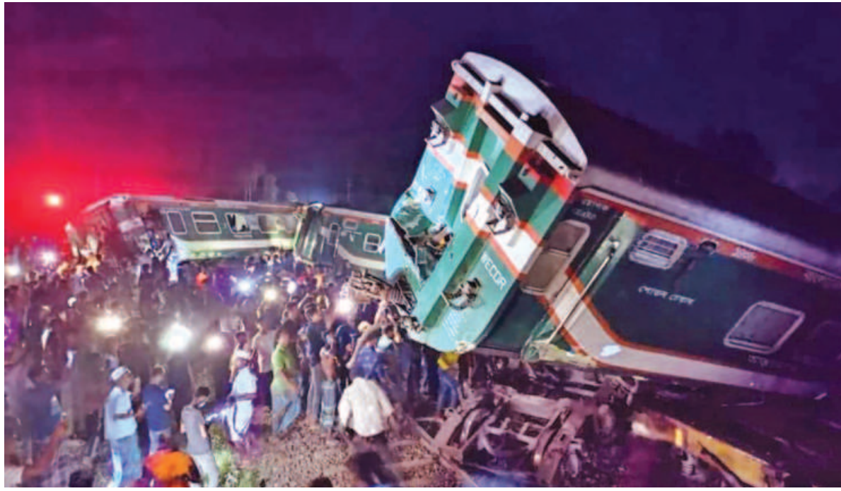
The mangled carriages of Sonar Bangla Express at the Hasanpur Railway Station of Cumilla's Nangalkot yesterday evening. The train was apparently diverted to the wrong line where a freight train was stationary. The collision left at least 30 people injured.