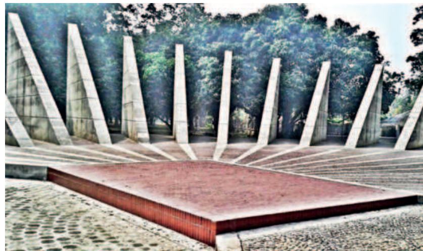
The Mujibnagar Monument with 23 pillars and a brick square in the centre, which marks the spot where the Mujibnagar government ministers took their oaths.