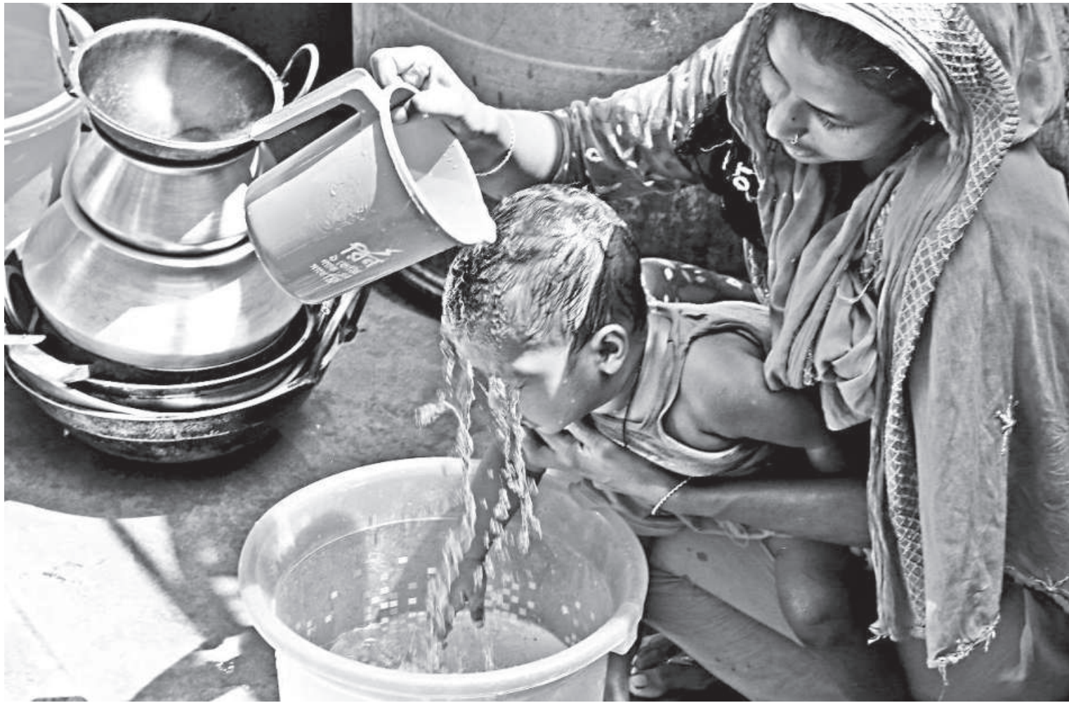
Placing her child on her lap, a mother pours a pail of water on the little one's head amid the ongoing heatwave. This photo was taken in Malibagh area recently.