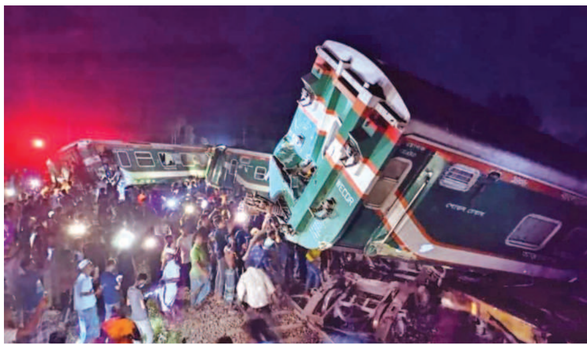
The mangled carriages of Sonar Bangla Express at the Hasanpur Railway Station of Cumilla's Nangalkot yesterday evening. The train was apparently diverted to the wrong line where a freight train was stationary. The collision left at least 30 people injured.