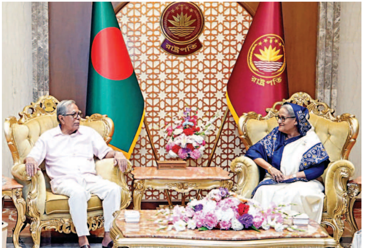
Prime Minister Sheikh Hasina calls on President Abdul Hamid at the Bangabhaban yesterday.