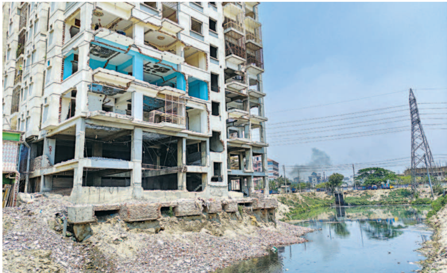
At least 18 of 81 flats of this 10-storey building have been demolished by the Dhaka South City Corporation as a portion of it was built over the Kalinagar canal next to Road-1 of Mahadi Nagar residential area in the capital's Kamrangirchar. Despite the risks involved, at least 22 families of the building are still living there. The photo was taken yesterday.