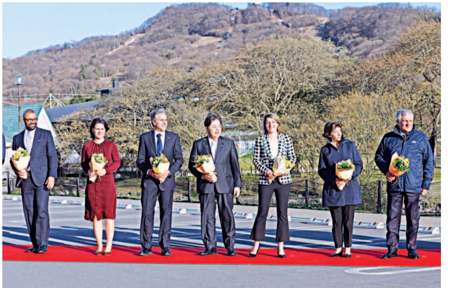
(From Left to Right) Britain's Foreign Secretary James Cleverly, German Foreign Minister Annalena Baerbock, US Secretary of State Antony Blinken, Japan's Foreign Minister Yoshimasa Hayashi, Canadian Foreign Minister Melanie Joly, French Foreign Minister Catherine Colonna and Italy's Foreign Minister Antonio Tajani pose at a welcoming ceremony for G7 Foreign Ministers' meeting in Karuizawa, Japan yesterday.

"Prepare all of them, feed and water them, check the wounded," Prigozhin was saying in the video. A group of Ukrainian prisoners were then shown being told that they would be passed back to Ukrainian forces. "I hope you don't fall back into our hands," an armed Wagner soldier was told telling the men before they were ordered into a truck.