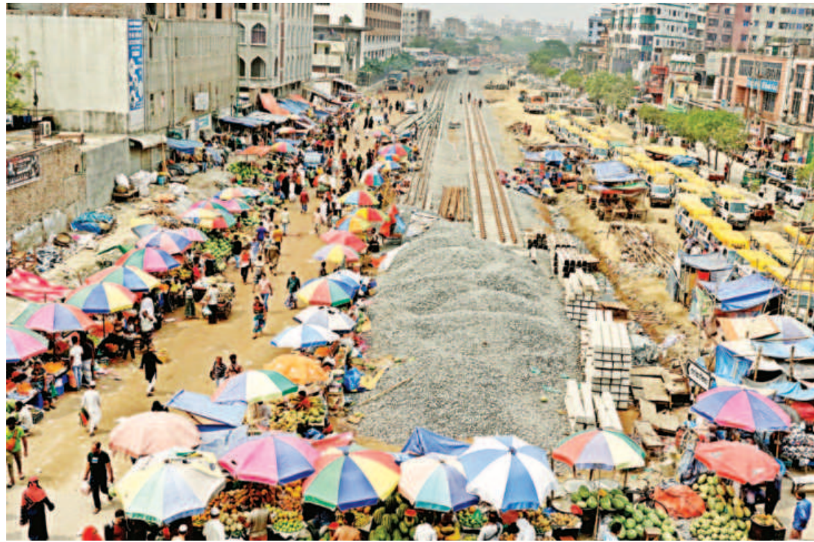
Makeshift shops and illegally parked people carriers, popularly known as Leguna, hamper the construction work of Dhaka-Padma Bridge rail link in Gandaria Rail Station area. It seems that the authorities concerned have not taken any steps to evict them. The photo was taken recently.