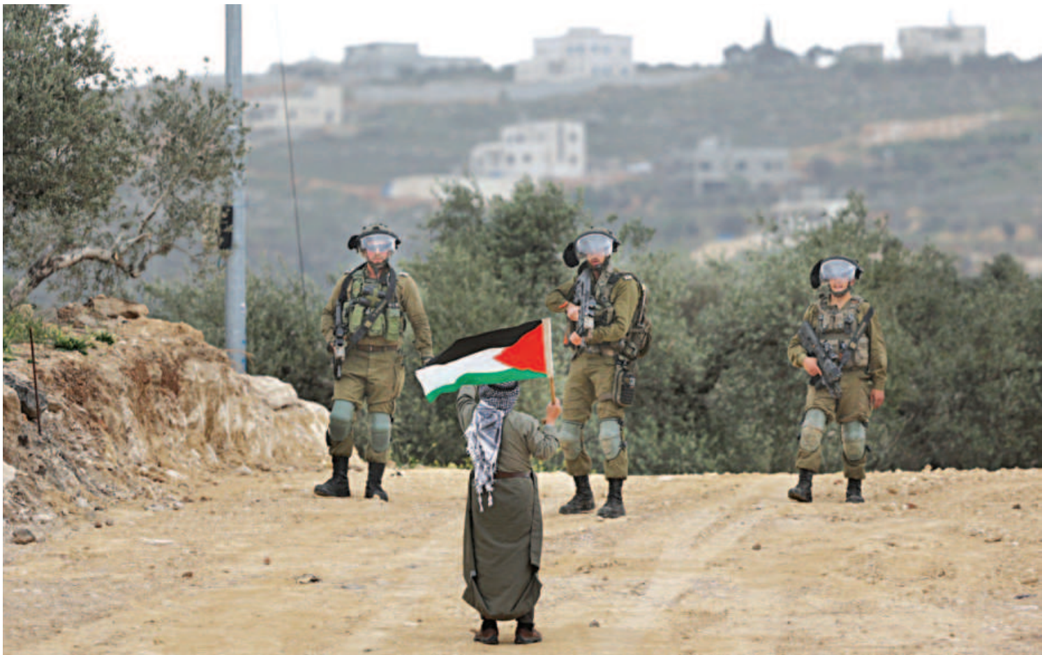
A Palestinian man confronts Israeli soldiers during a protest in the village of Beita, south of Nablus in the occupied West Bank, yesterday, against a march by settlers to the nearby Israeli outpost of Eviatar.