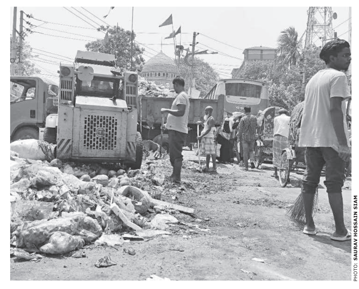
Although designated dumping zones exist in the city, locals repeatedly dump garbage openly on the busy Sirajuddolla Road in Narayanganj. As a result, city corporation workers are seen picking up garbage off the spot in the afternoon, which lead to congestion on the road. This photo was taken yesterday.