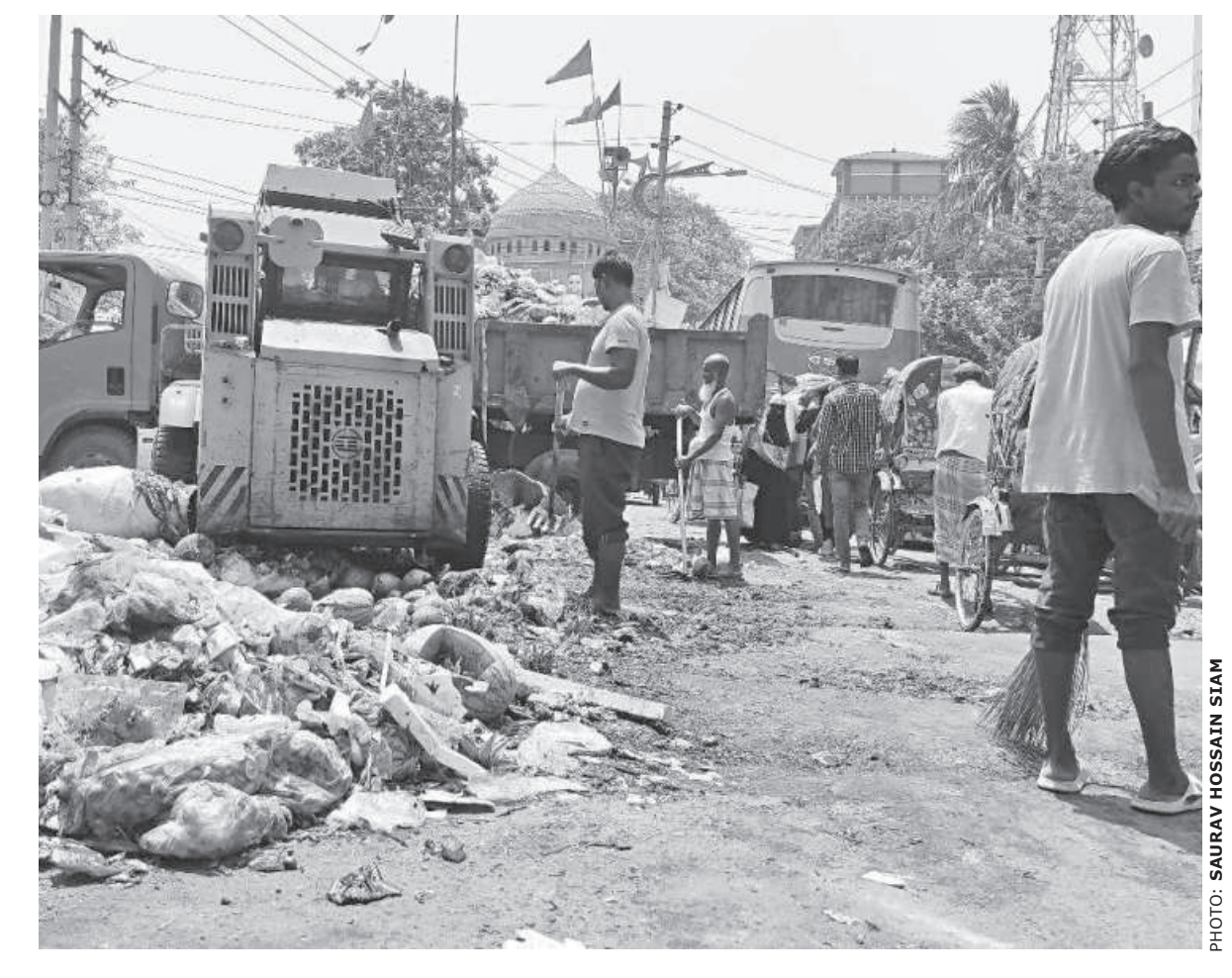
Although designated dumping zones exist in the city, locals repeatedly dump garbage openly on the busy Sirajuddolla Road in Narayanganj. As a result, city corporation workers are seen picking up garbage off the spot in the afternoon, which lead to congestion on the road. This photo was taken yesterday.