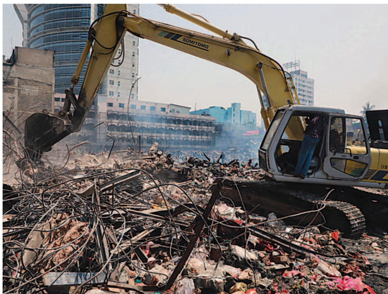
An excavator yesterday removes the debris from Bangabazar, which was destroyed by a massive fire on April 4, as traders are going to start their business on Wednesday by setting up makeshift shops there.