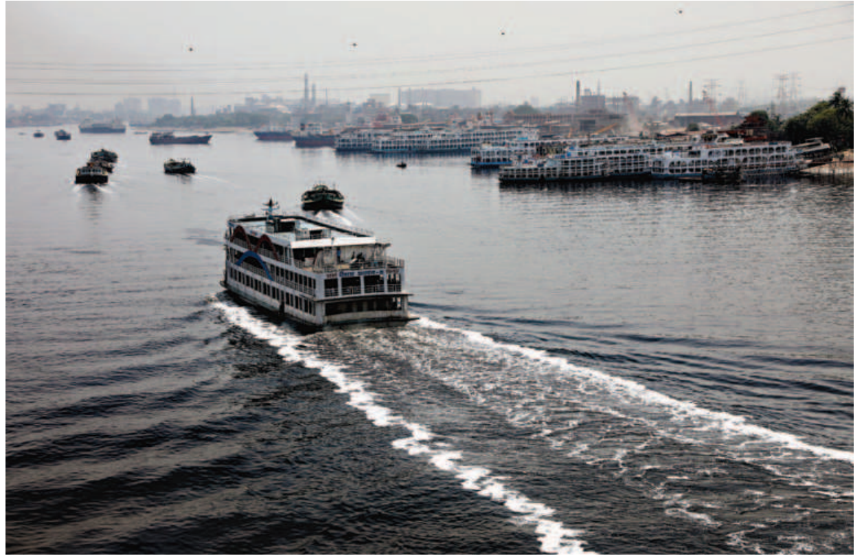
Liquid waste from different factories have darkened the water of the Buriganga in Postogola area in the capital. The water remains in this state until monsoon when heavy showers increases the water flow. The photo was taken last week.