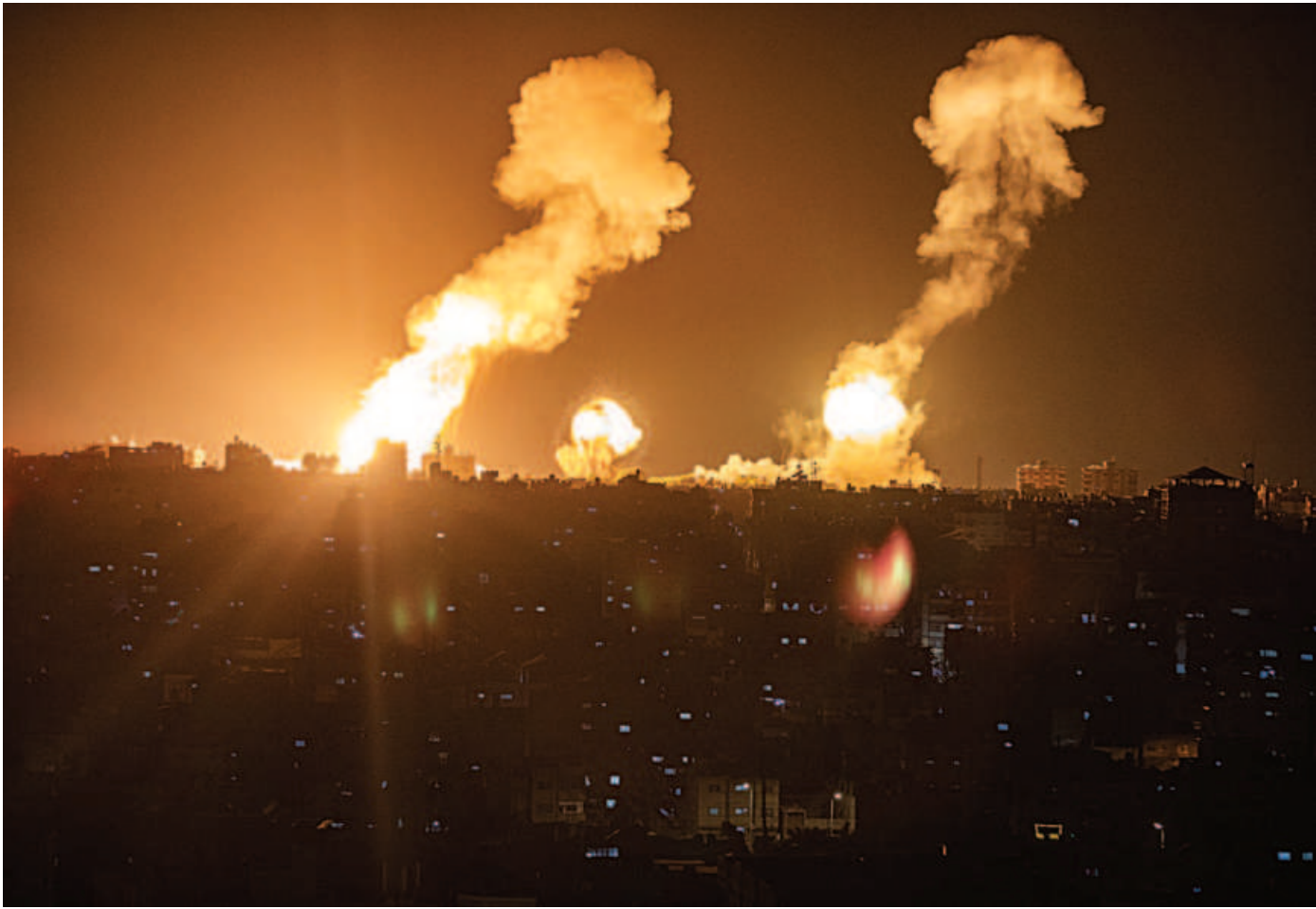
This picture taken early yesterday shows explosions in Khan Yunis in the southern Gaza Strip during Israeli air strikes on the Palestinian enclave.