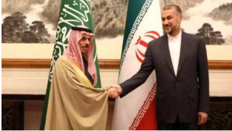
Iranian FM Hossein Amir-Abdollahian, right, meets Saudi FM Prince Faisal bin Farhan Al Saud in Beijing, China yesterday.

Saudi Arabia, the world’s biggest oil exporter, and Shia-majority Iran, strongly at odds with Western governments over its nuclear