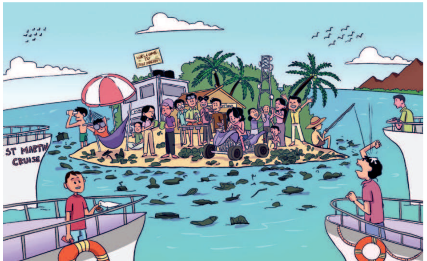
ILLUSTRATION: JUNAID IQBAL ISHMAM

Aside from these, picking up corals and sea-shells is also another seemingly harmless tourist activity that actually has grave consequences. Sea-shells are admittedly gorgeous to look at and to decorate with, but they're home to tiny organisms. Picking them up for collection causes these organisms to die, as they're taken out of their natural habitat.