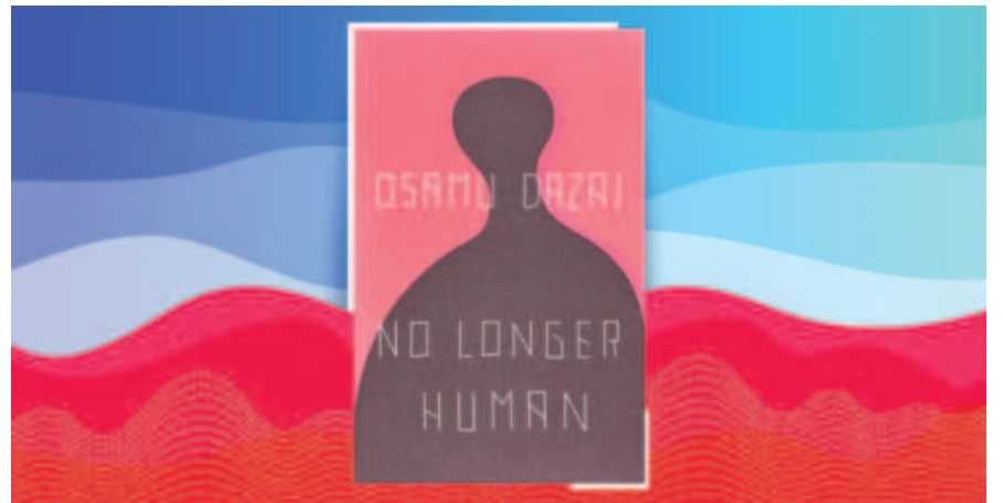
DESIGN: FAISAL BIN IQBAL