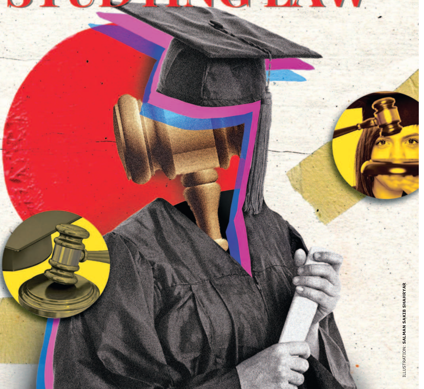
ILLUSTRATION: SALMAN SAKIB SHAHRYAR