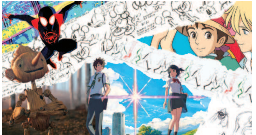
DESIGN: ABIR HOSSAIN