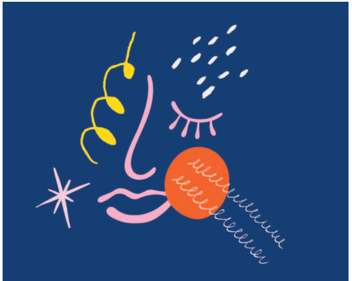
ILLUSTRATION: ABIR HOSSAIN