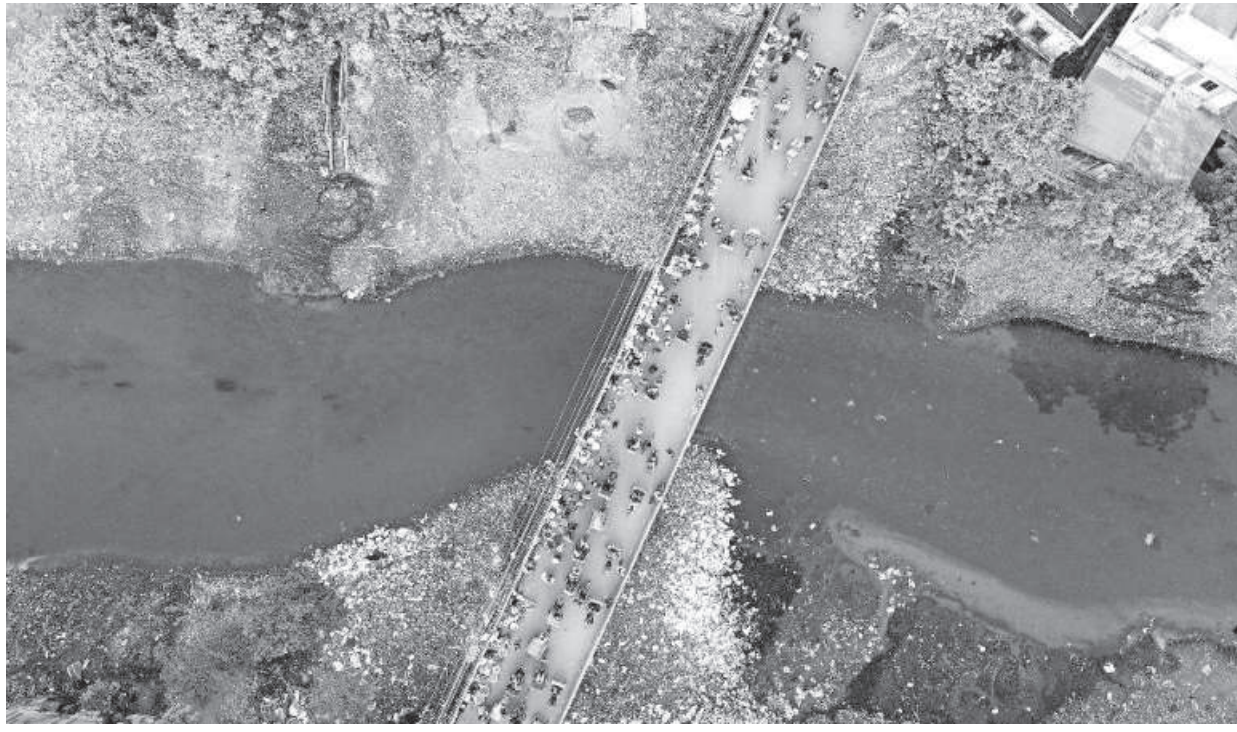
The condition of Karatoa River in Bogura, shrunk into a canal-like state due to rampant encroachment and subsequent pollution, depicts the reality of rivers in Bangladesh.