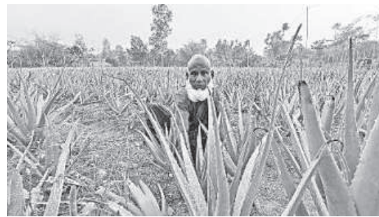
Farmers tend to an aloe vera and a Kalmegh field in Tangail's Madhupur upazila.