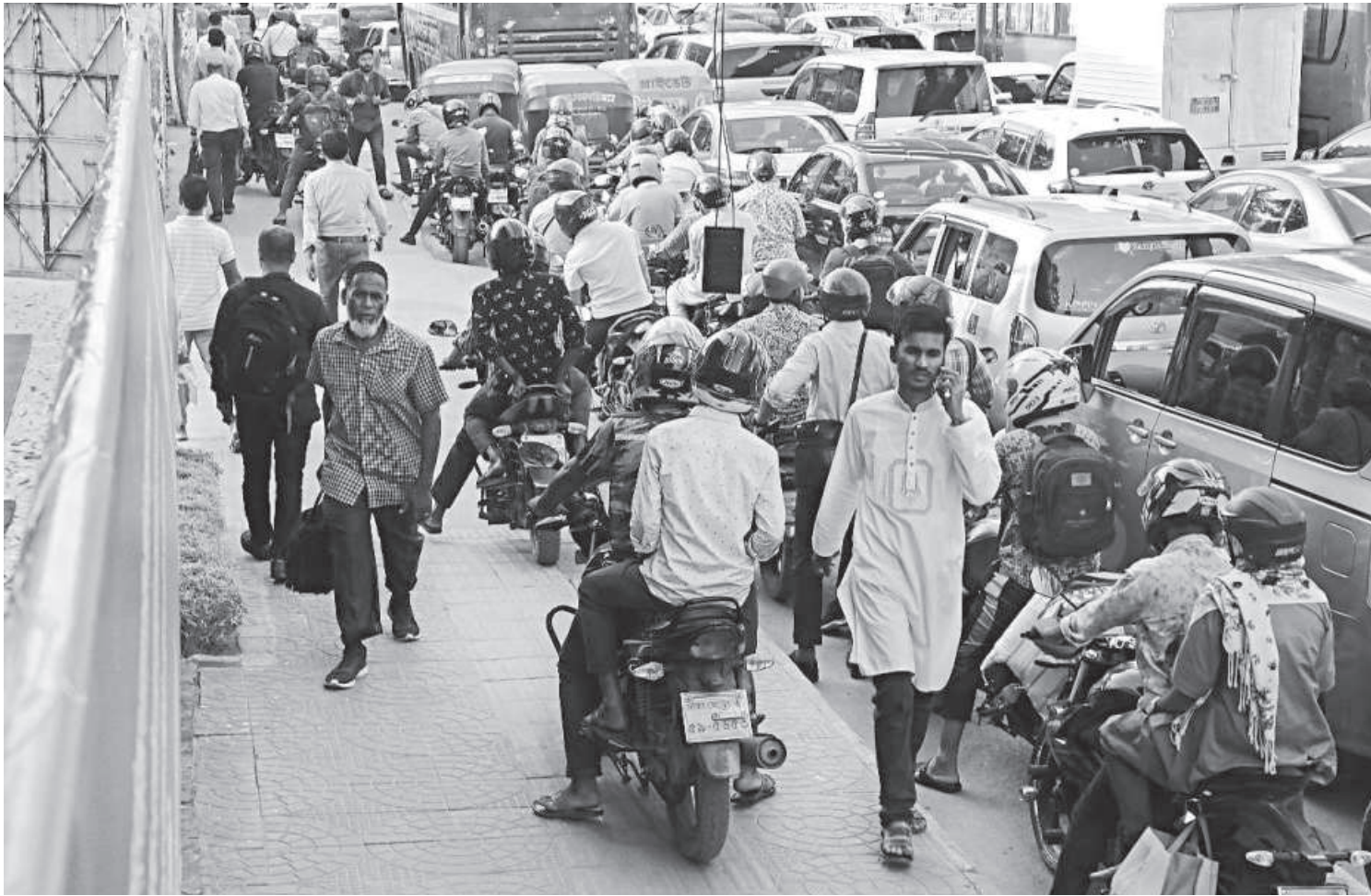
When there's traffic ahead, many motorbike riders have built a habit of obstructing pedestrian movement by plying their bikes on the footpaths to save time. As a result, sometimes, even the footpaths get clogged with traffic due to the two-wheelers. Such activities go on unabated, as authorities can hardly intervene amid traffic. This photo was taken in Banglamotor area yesterday.