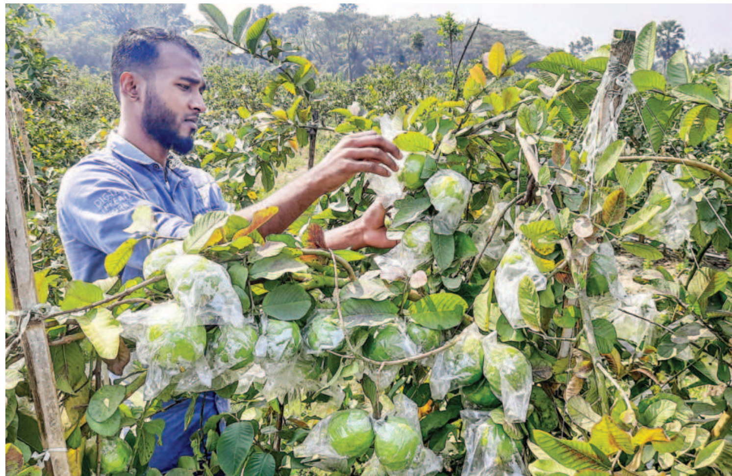
As Bangladesh currently meets about 60 per cent of its demand for fruits through imports at an annual cost of around $30 million, the government took the project with an aim to train farmers, increase production and subsequently reduce dependence on imports.