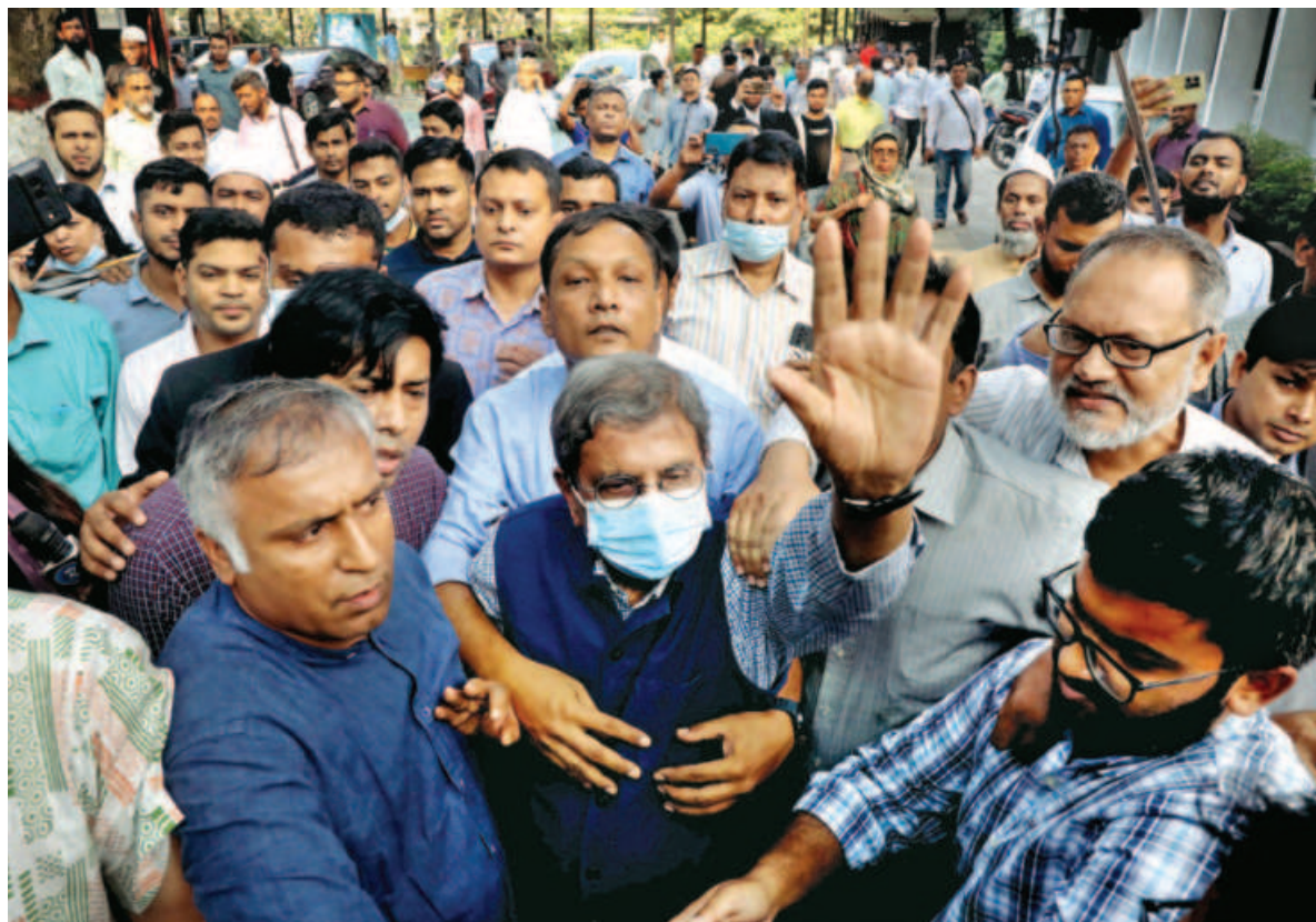
Prothom Alo Editor and Publisher Matiur Rahman waving at journalists after the High Court granted him an anticipatory bail for six weeks yesterday. The photo was taken on the court premises.