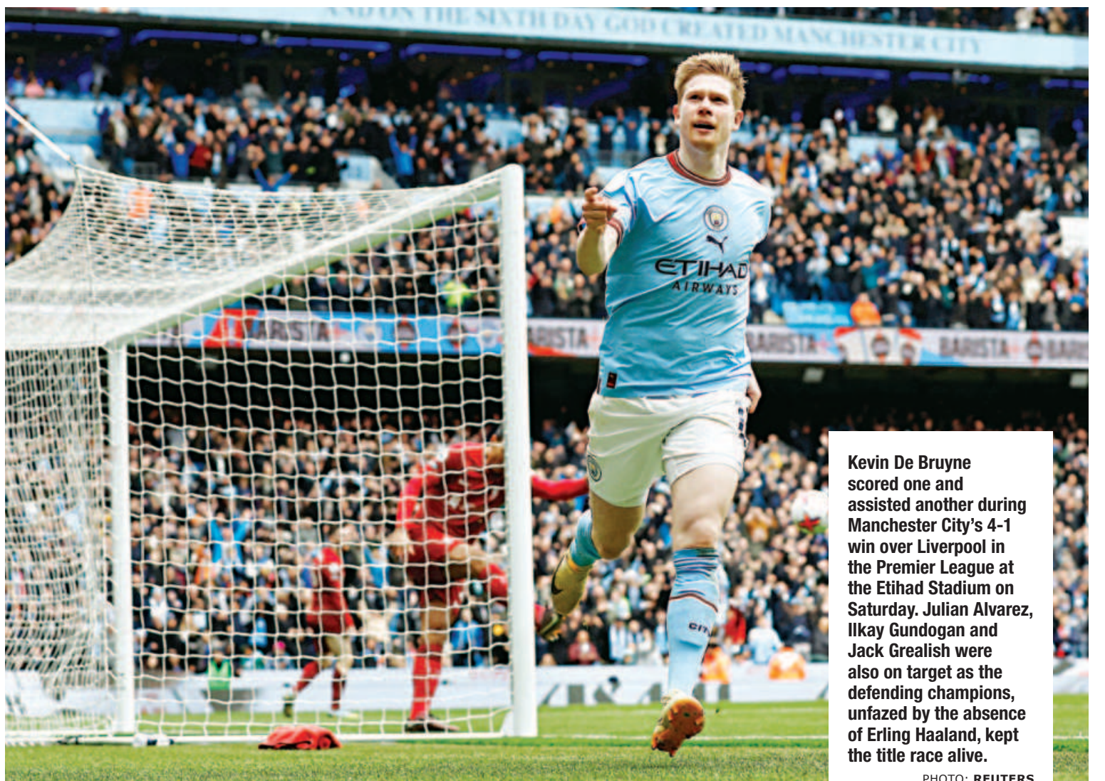
Kevin De Bruyne scored one and assisted another during Manchester City's 4-1 win over Liverpool in the Premier League at the Etihad Stadium on Saturday. Julian Alvarez, Ilkay Gundogan and Jack Grealish were also on target as the defending champions, unfazed by the absence of Erling Haaland, kept the title race alive.