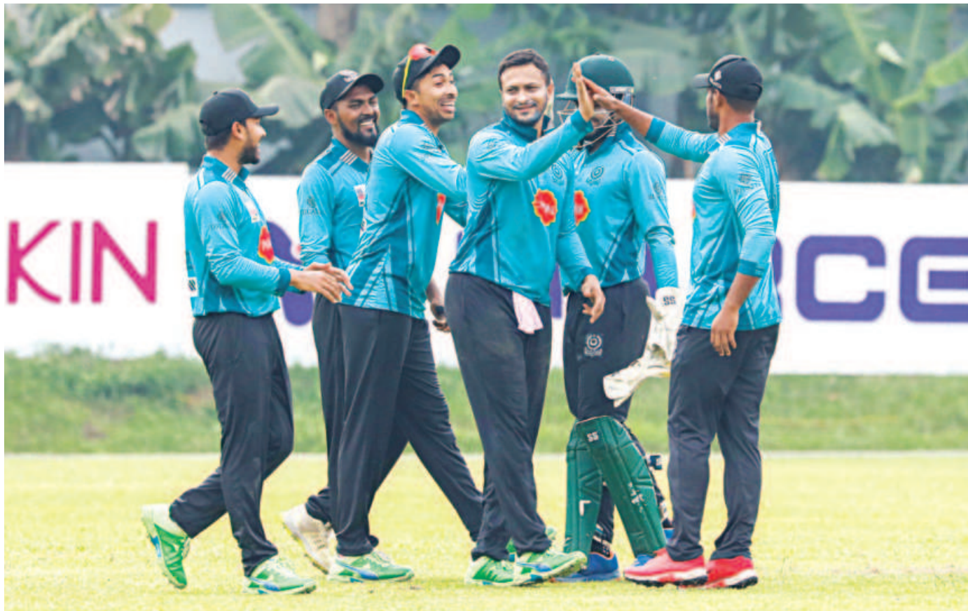
Shakib Al Hasan featured for Mohammedan Sporting Club for the first time in 12 years in the 50-over format yesterday as the domestic powerhouse registered their first win of the ongoing Dhaka Premier League by beating Sheikh Jamal Dhanmondi Club by 22 runs at BKSP-4. Shakib, who misfired with the bat but conceded just 31 runs in his 10 overs, including a maiden, left for the capital for a commercial engagement by a helicopter before the match concluded.