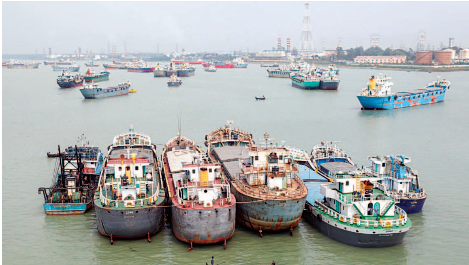
Cargo movement through inland waterways has decreased in recent times as ongoing difficulties in opening letters of credit leading to lower imports means there is less to carry for the vessels on river routes. The picture was taken from the Shah Amanat Bridge over the Karnaphuli river in Chattogram recently.