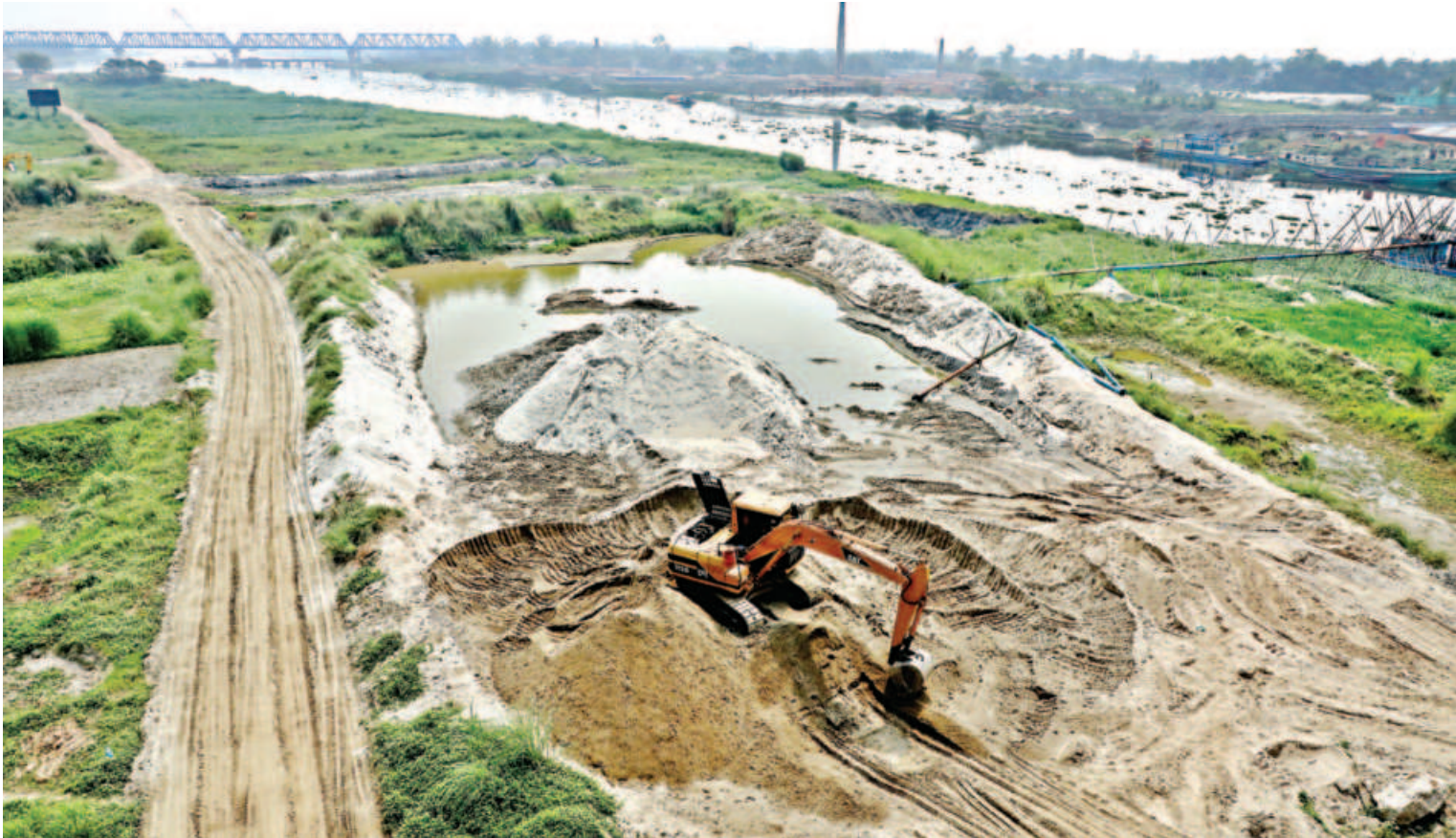
Encroaching on a part of the Dhaleshwari, traders are extracting sand from the bed of the river near Bangabandhu Sheikh Mujibur Rahman Expressway in Sirajdikhan, Munshiganj. Unplanned sand extraction in the lean season disrupts the natural flow of water in monsoon. The photo was taken recently.