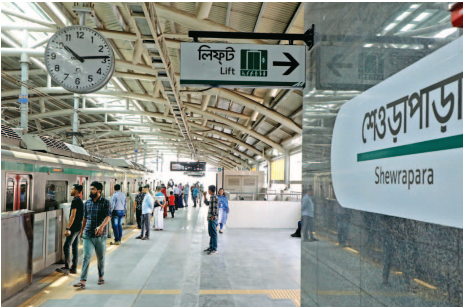
Metro rail authorities yesterday opened the Shewrapara and Uttara south stations to the public. With this, all the nine stations between Agargaon and Uttara in the capital are now operational.