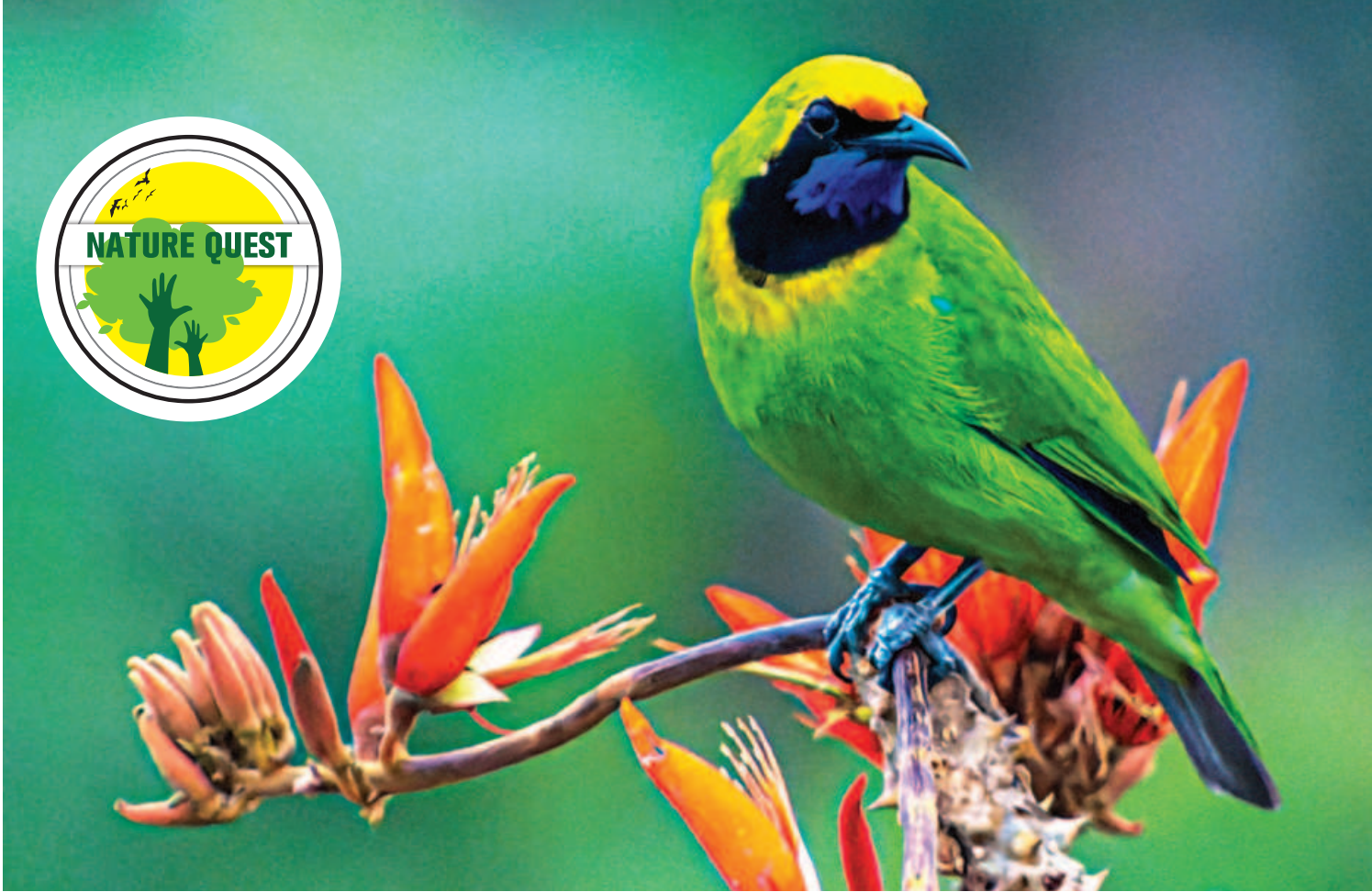
OF GOLDS AND GREENS ... A golden-fronted leafbird perched on a flowering plant in Habiganj's Satchari National Park. These bulbul-sized birds' range extends from the Indian subcontinent and south-western China to south-east Asia and Sumatra, and they generally prefer tropical areas as their habitat. Tiny but territorial, golden-fronted leafbirds will not tolerate other species in their zone. They prefer being in the comfort of their own kind and tend to stay in pairs. What makes them striking is the various colours in their plumage -- the green feathers extending to the dark face bordered with a yellow throat, a blue chin, and a spectacular orange finish on the forehead, for which they are called "golden-fronted". Their calls are like fluid chirps -- if you can mimic it, they will chirp right back at you!