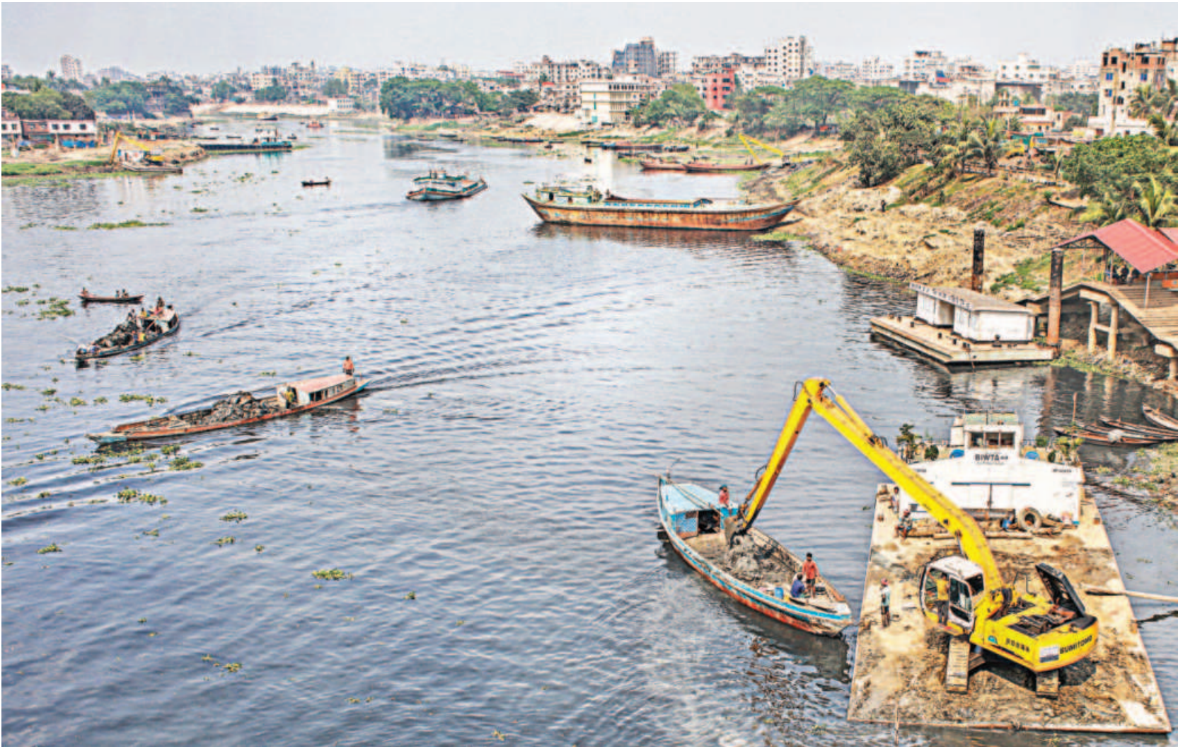
With excavators, the BIWTA is dredging the Turag river in the capital's Gabtoli to improve navigability. The photo was taken yesterday.