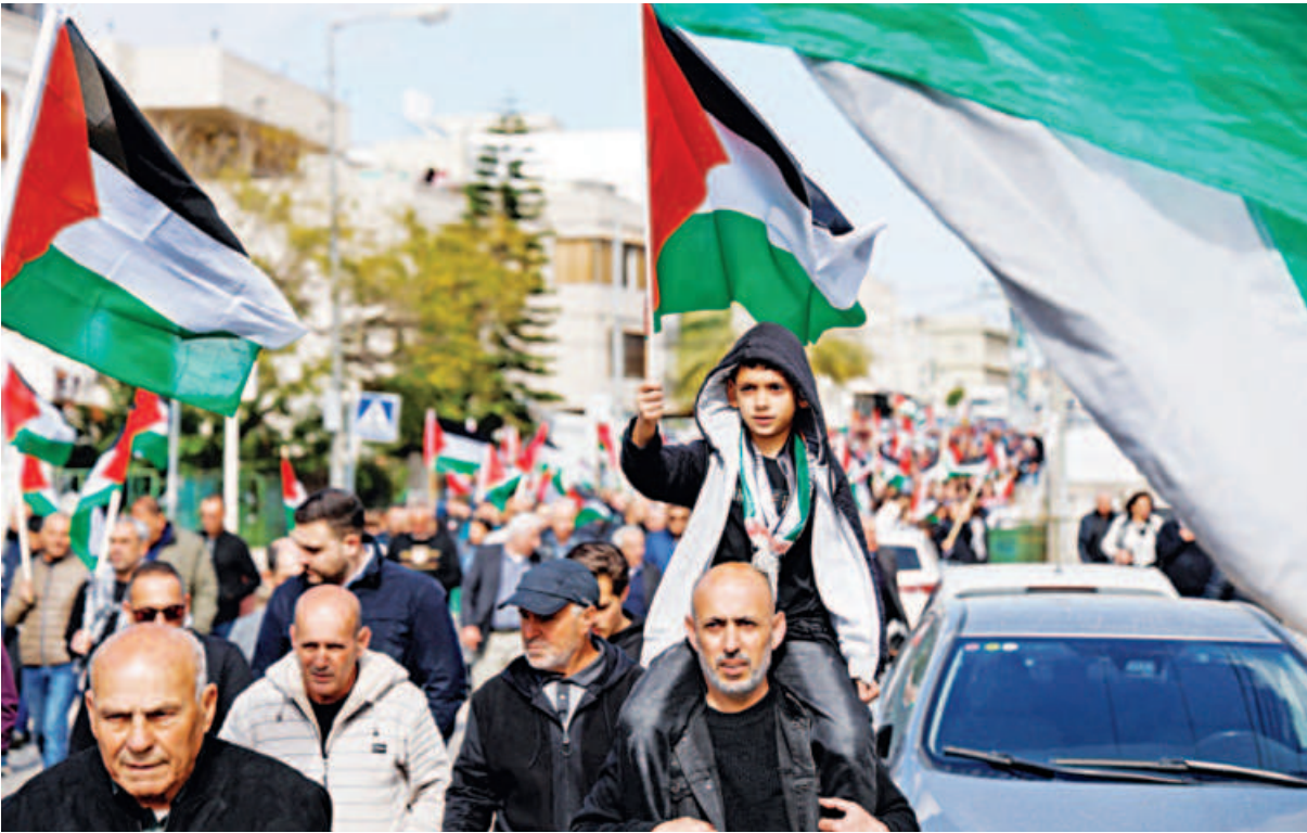
Israeli Arabs hold Palestinian flags as they take part in a “Land Day” rally, an annual commemoration of the killing of six Arab citizens by Israeli security forces in 1976 during protests against land confiscations, in Sakhnin, northern Israel yesterday.