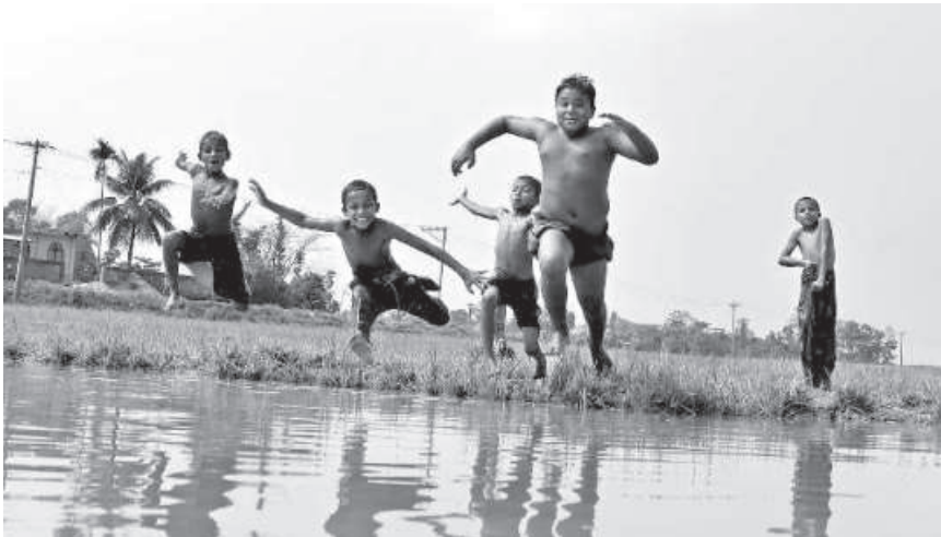
These youngsters in Sylhet Sadar upazila's Baurkandi area have found a new activity after the canals and beels filled with rainwater due to the recent rainfall. At different points of the day, they take a dip and enjoy their playtime together. The photo was taken yesterday.

FROM PAGE 3 the country's constitution gives every citizen the right to freedom of expression, however, the sedition law, a provision of colonial times, punishes speeches against governments with up to imprisonment for life. The above-mentioned provision is identical to Section 124A of the Bangladesh Penal Code, and cases are often filed under the section against people. The provision is also identical to Section 124A of the Indian Penal Code, which was put in abeyance by the Indian Supreme Court last year (till the union government reconsiders the provision). In an interim order, the Indian SC had urged the centre and state governments to refrain from registering any FIRs under the said provision while it was under re-consideration. A bench comprising the Chief Justice of India NV Ramana, Justice Surya Kant and Justice Hima Kohli held that all pending trials, appeals and proceedings with respect to charges framed under Section 124A be kept in abeyance.